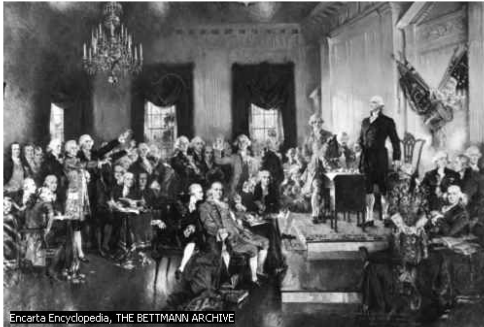
Encarta Encyclopedia, THE BETTMANN ARCHIVE