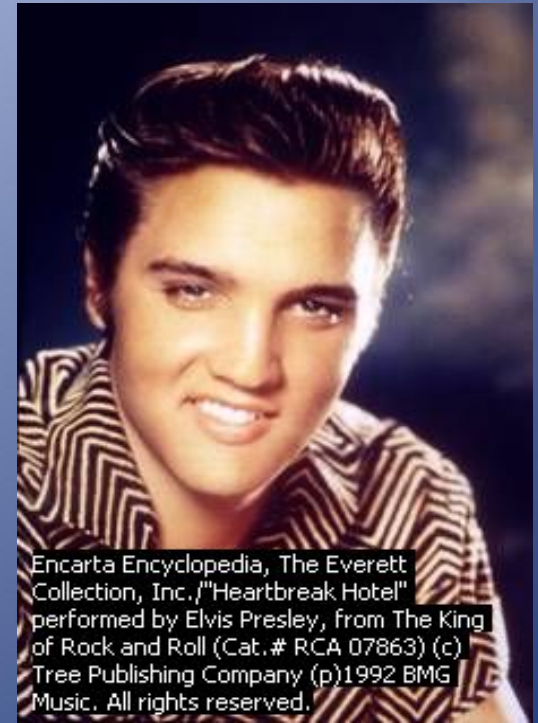
Encarta Encyclopedia, The Everett Collection, Inc. / "Heartbreak Hotel" performed by Elvis Presley, from The King of Rock and Roll (Cat. # RCA 07863) (c) Tree Publishing Company (p)1992 BMG Music. All rights reserved.