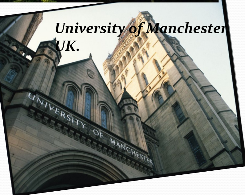
University of Manchester UK.