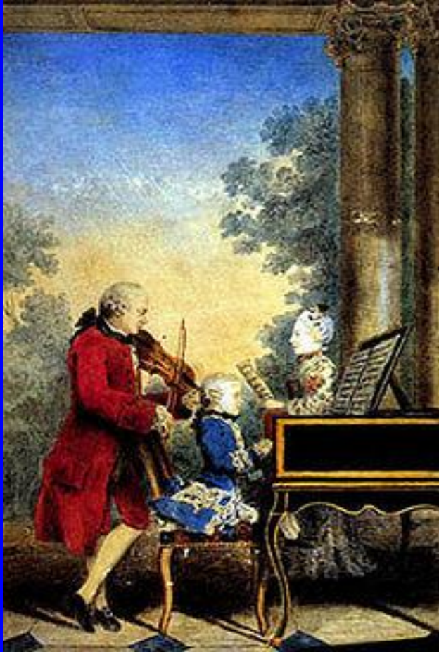
The Mozart family on tour: Leopold, Wolfgang, and Nannerl. Watercolor by Carmontelle, ca. 1763[8]