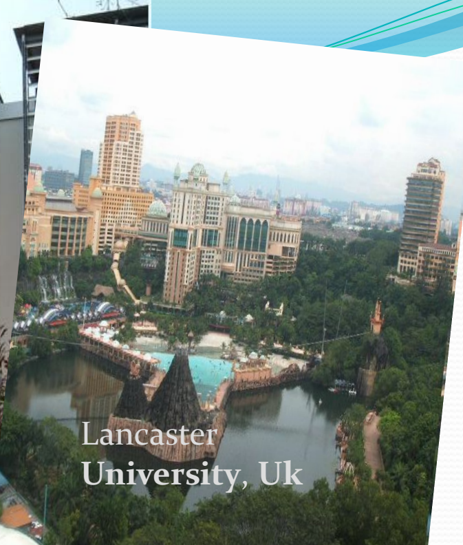
Lancaster University, UK