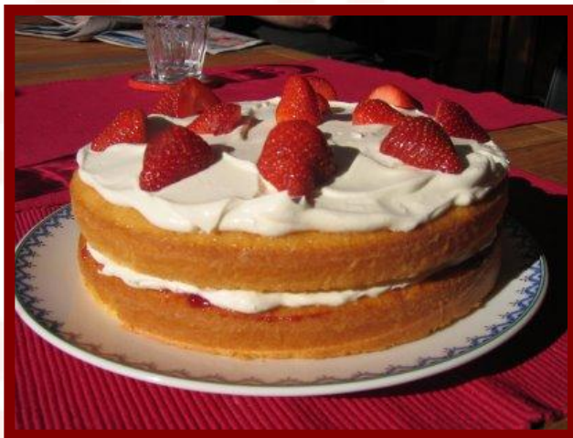
The Victoria Sponge Named after Queen Victoria

Although many foreigners find British food disgusting, British teenagers in the survey enjoy eating bacon sandwiches, baked beans, cheddar cheese and curry (well, it's not British but it is one of Britain's most popular foods). Also, we know it's a British stereotype but many British teenagers still like drinking a nice cup of tea in the morning.