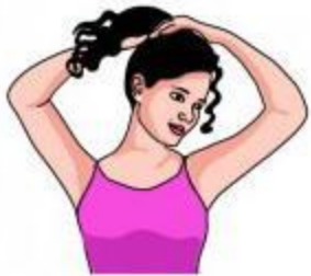
do your hair