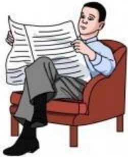
read the paper