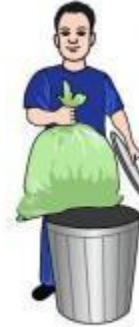
take out the trash