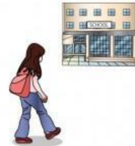
go to school