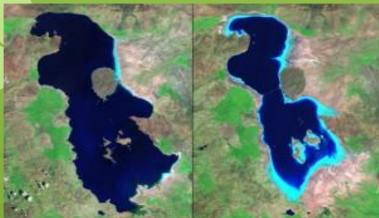
Lake Urmia. Left: 1985. Right: August 2010.

Vast forests are cut and burn in fire. Their disappearance upsets the oxygen balance. As a result some rare species of animals, birds, fish and plants disappear forever, a number of rivers and lakes dry up.