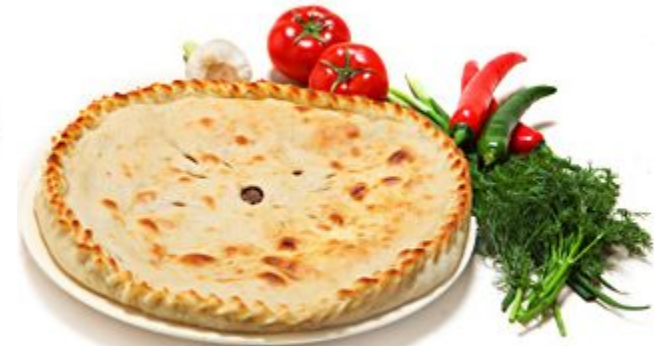
Fydchin – meat pie