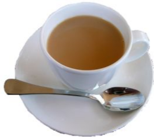
Tea with milk