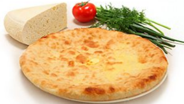
Ualibah – cheese pie