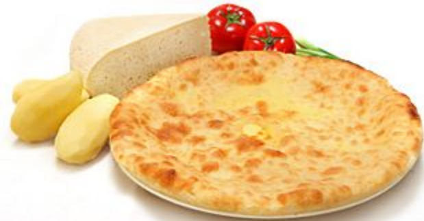
Kartofchin – potato pie