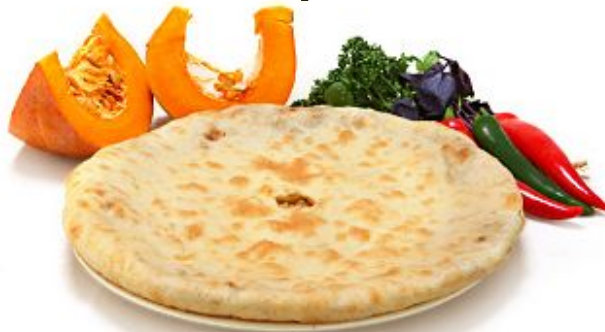
Nashchin – pumpkin pie