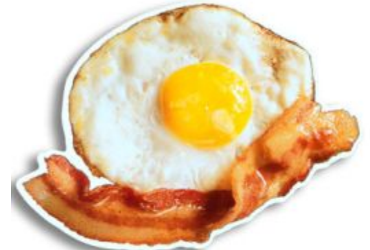
Bacon and eggs