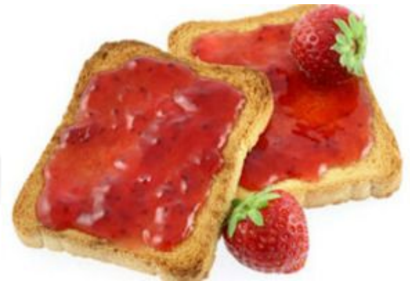
Toast and jam