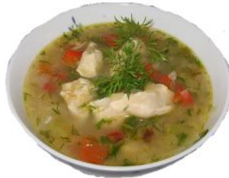
Chicken soup with onion