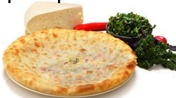
Saharadzhin – beet leaves pie