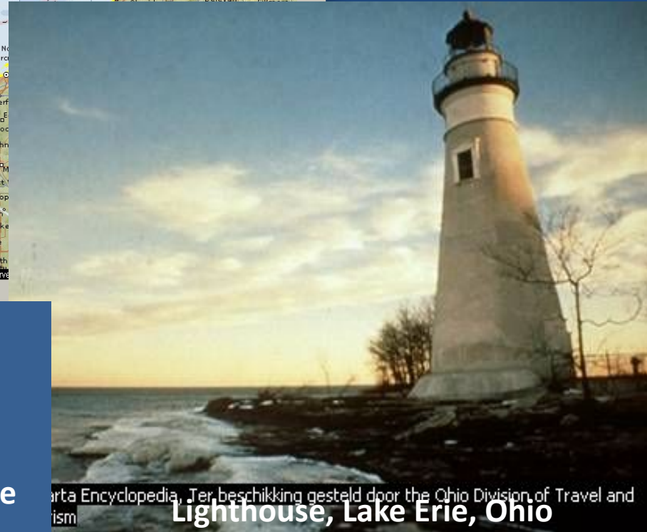
Lighthouse, Lake Erie, Ohio

Lake Erie, the southernmost of the Great Lakes, is the shallowest, with an average depth of only 19 m (62 ft). This presents navigational difficulties for ships during stormy weather, necessitating the presence of lighthouses, such as this one at Marblehead in Ohio.