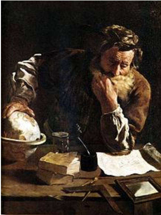
Archimedes was among the greatest mathematicians of antiquity.