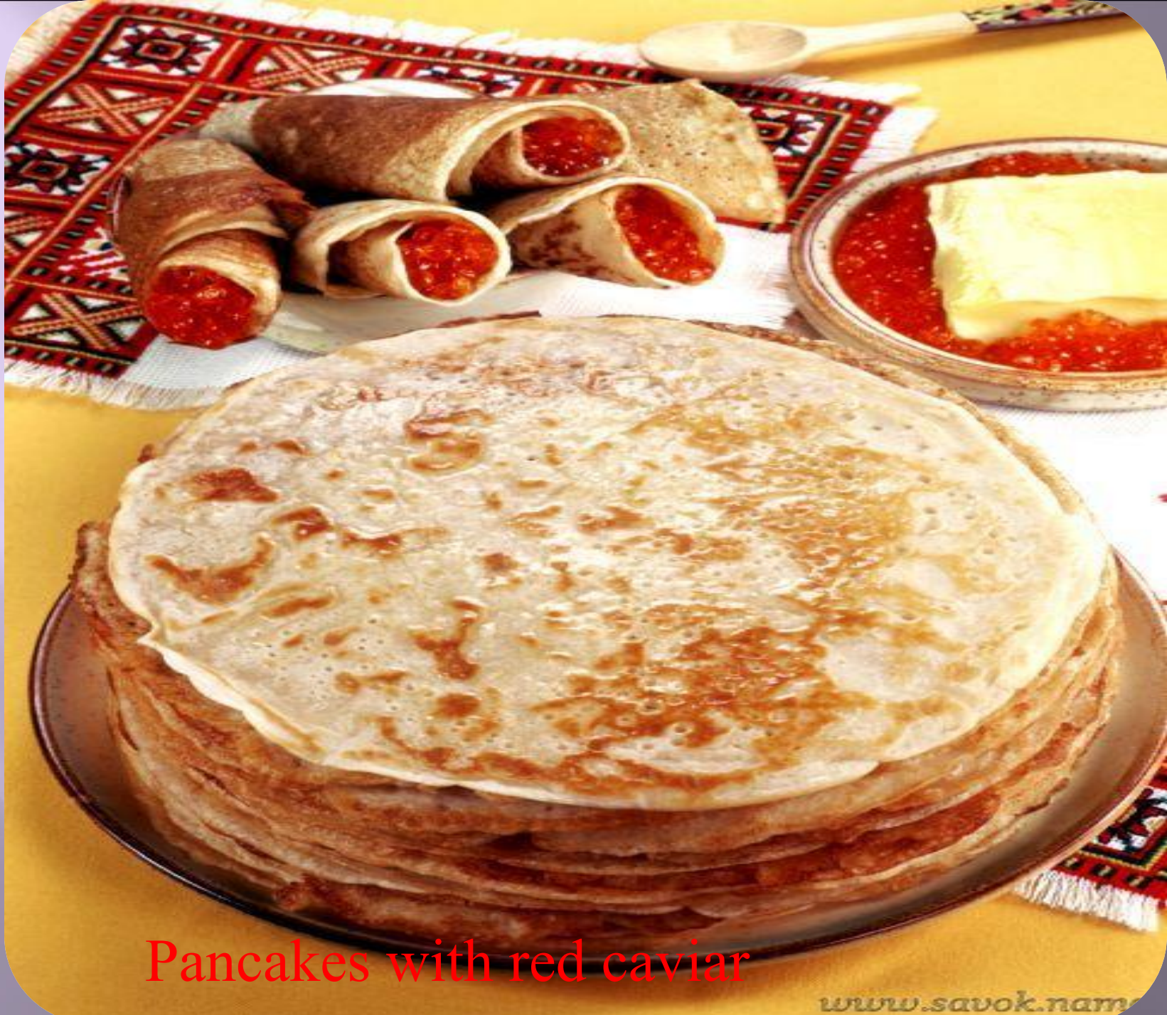
Pancakes with red caviar