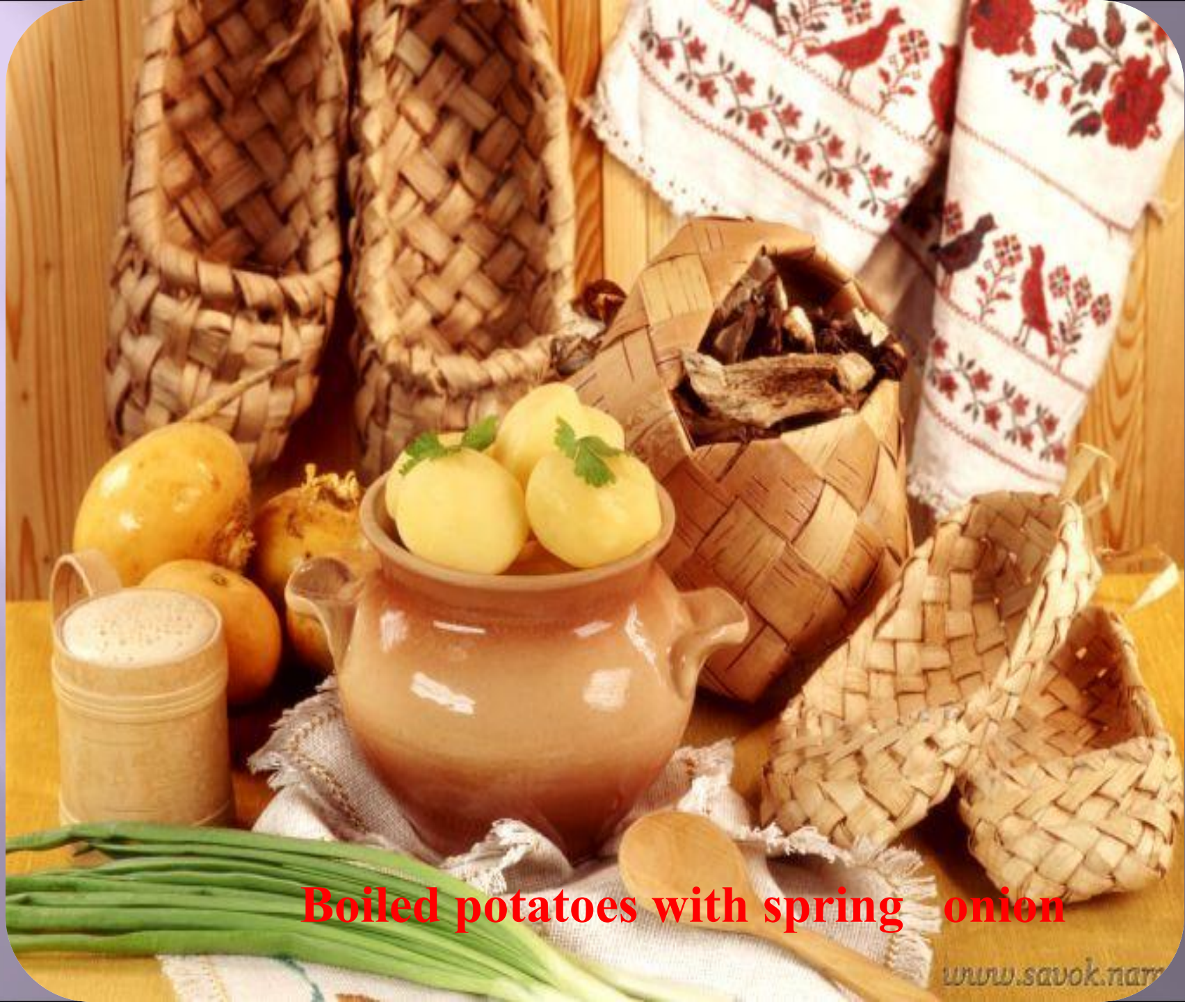
Boiled potatoes with spring onion