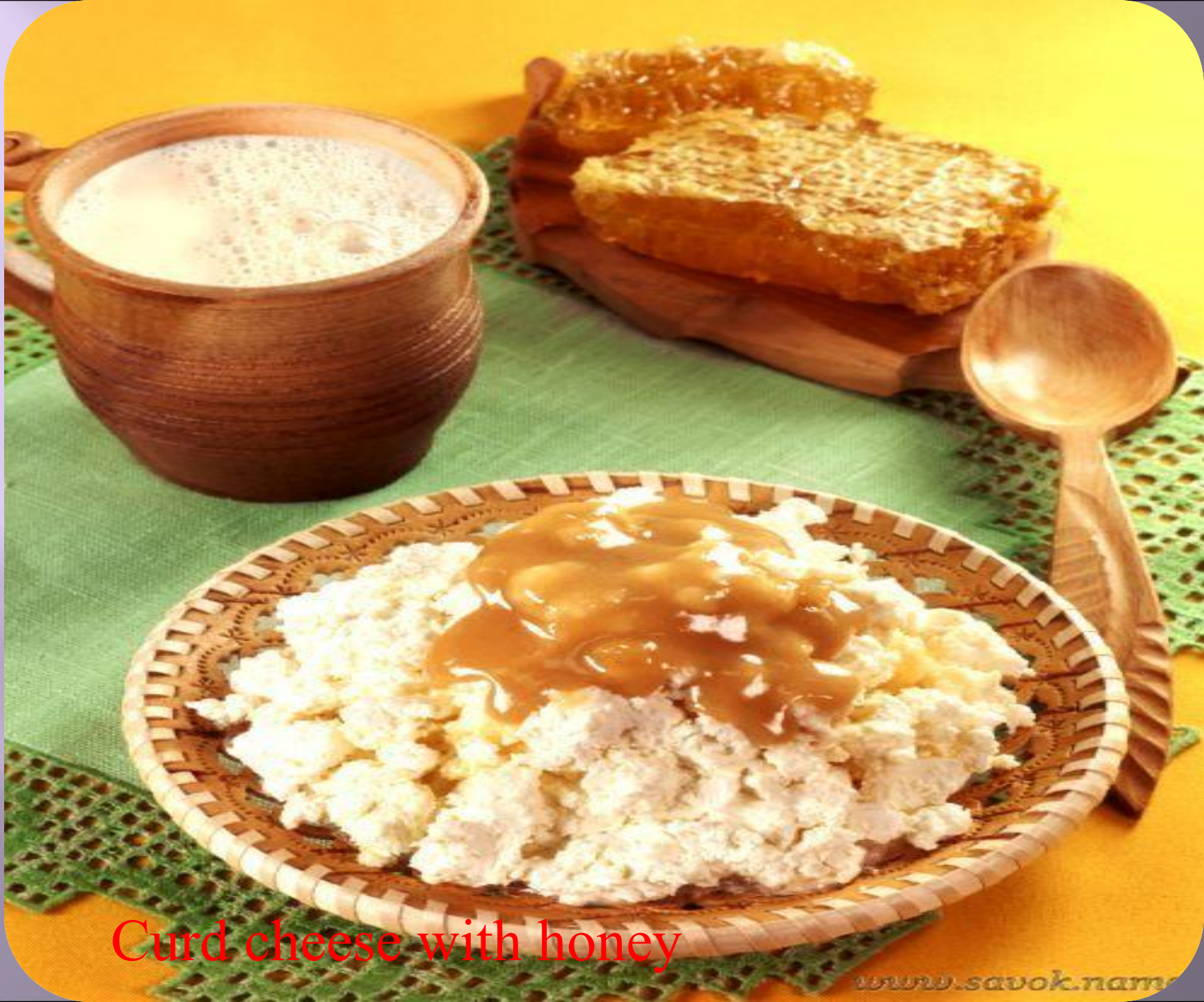
Curd cheese with honey