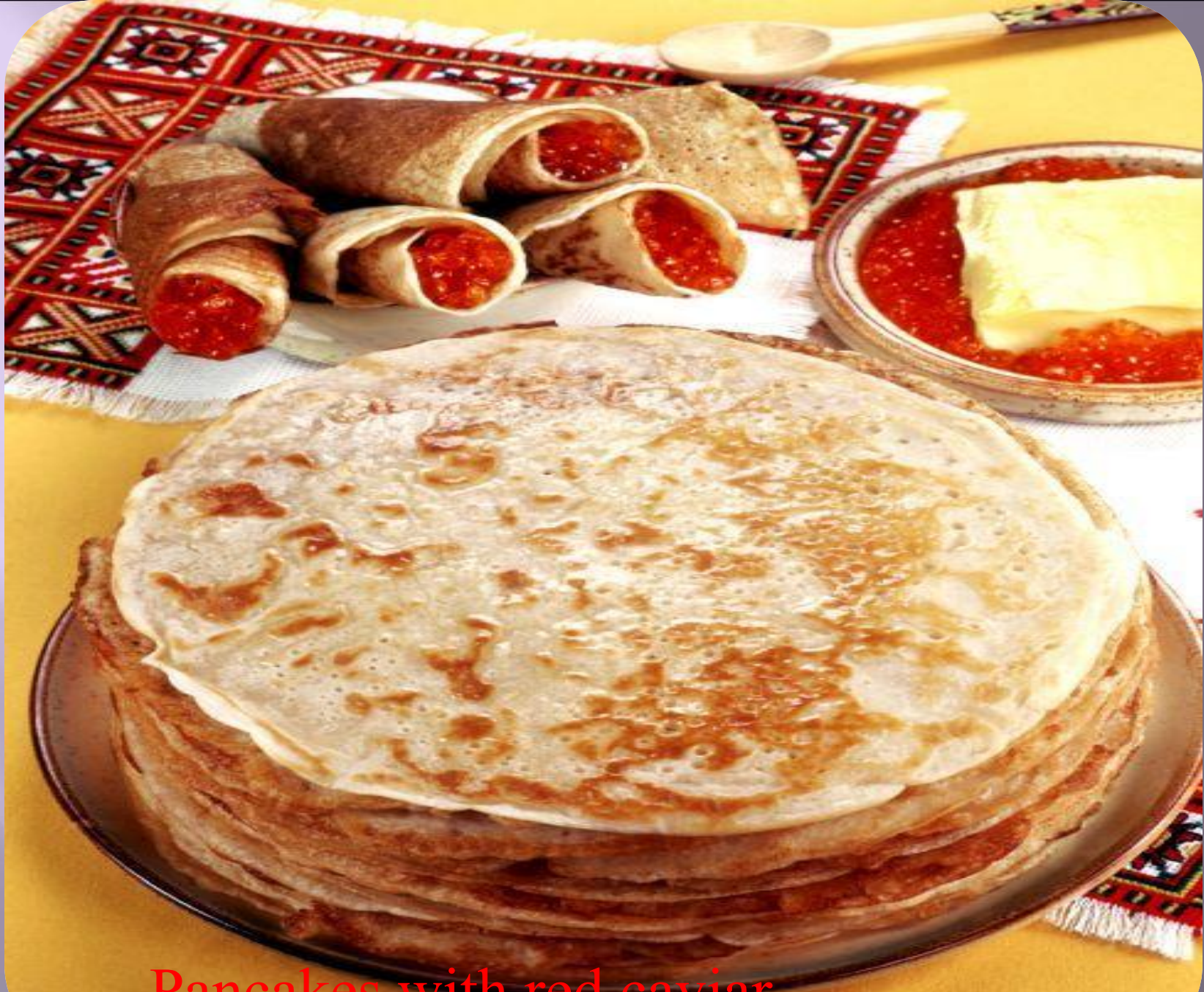
Pancakes with red caviar