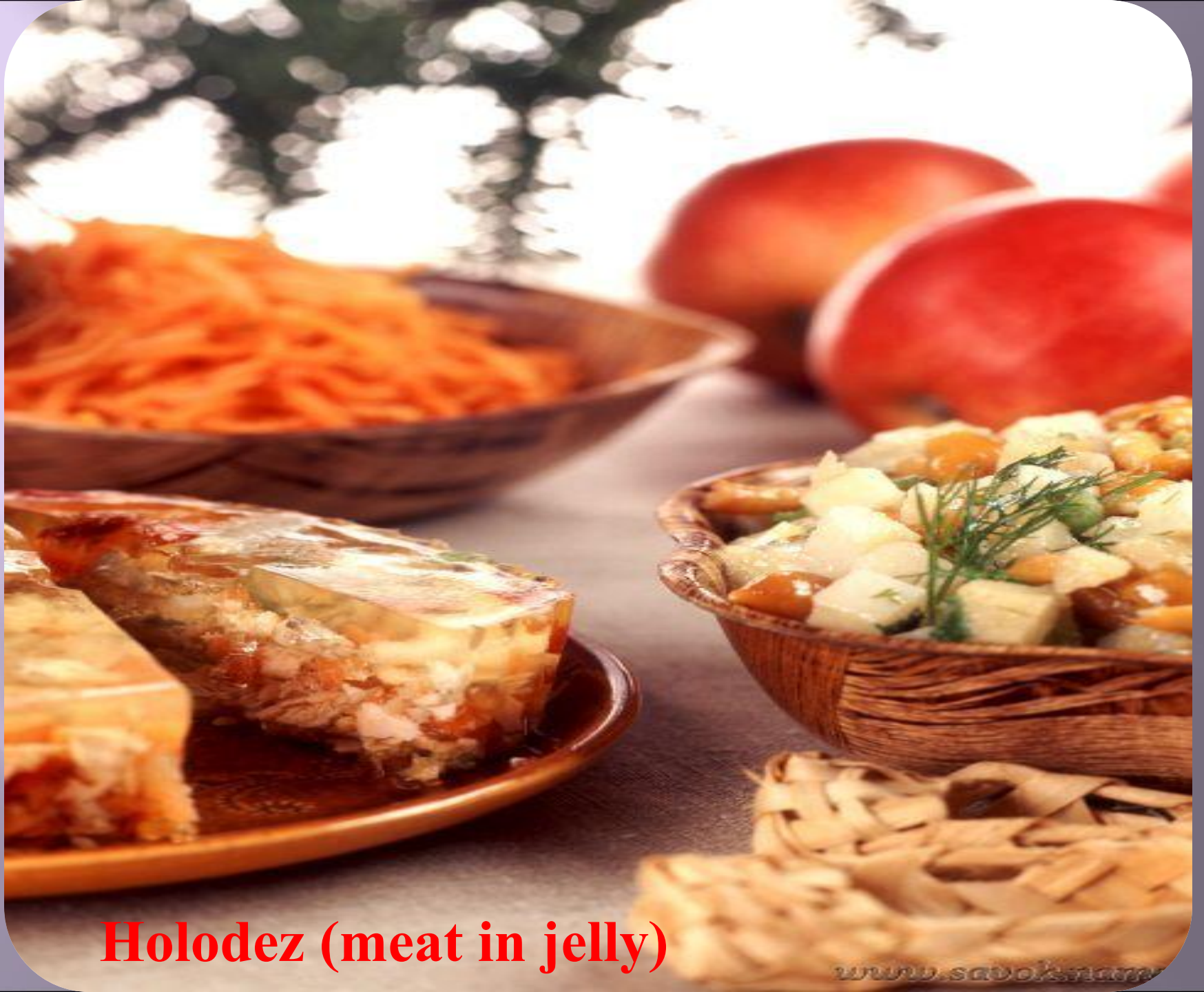
Holodez (meat in jelly)