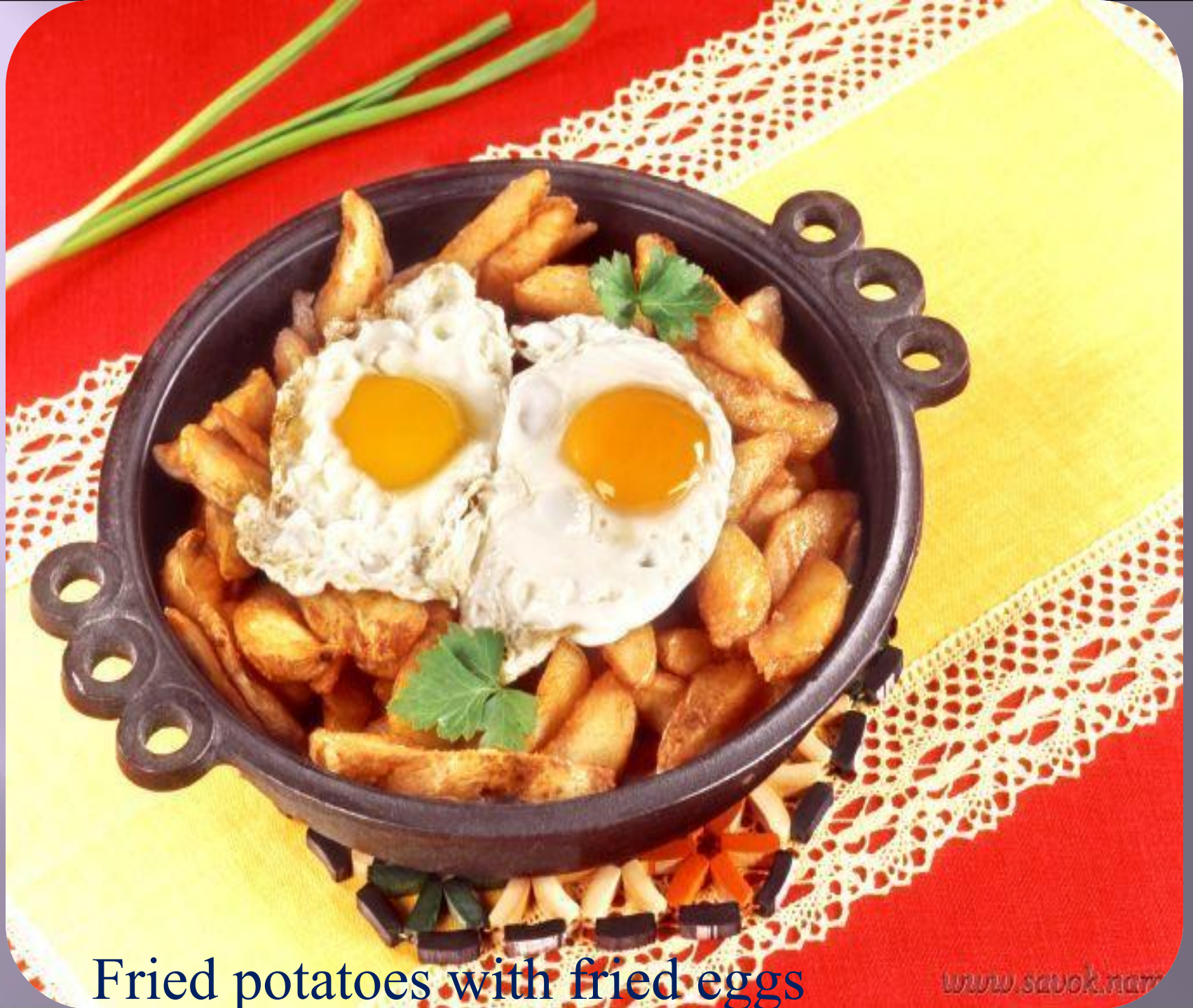
Fried potatoes with fried eggs