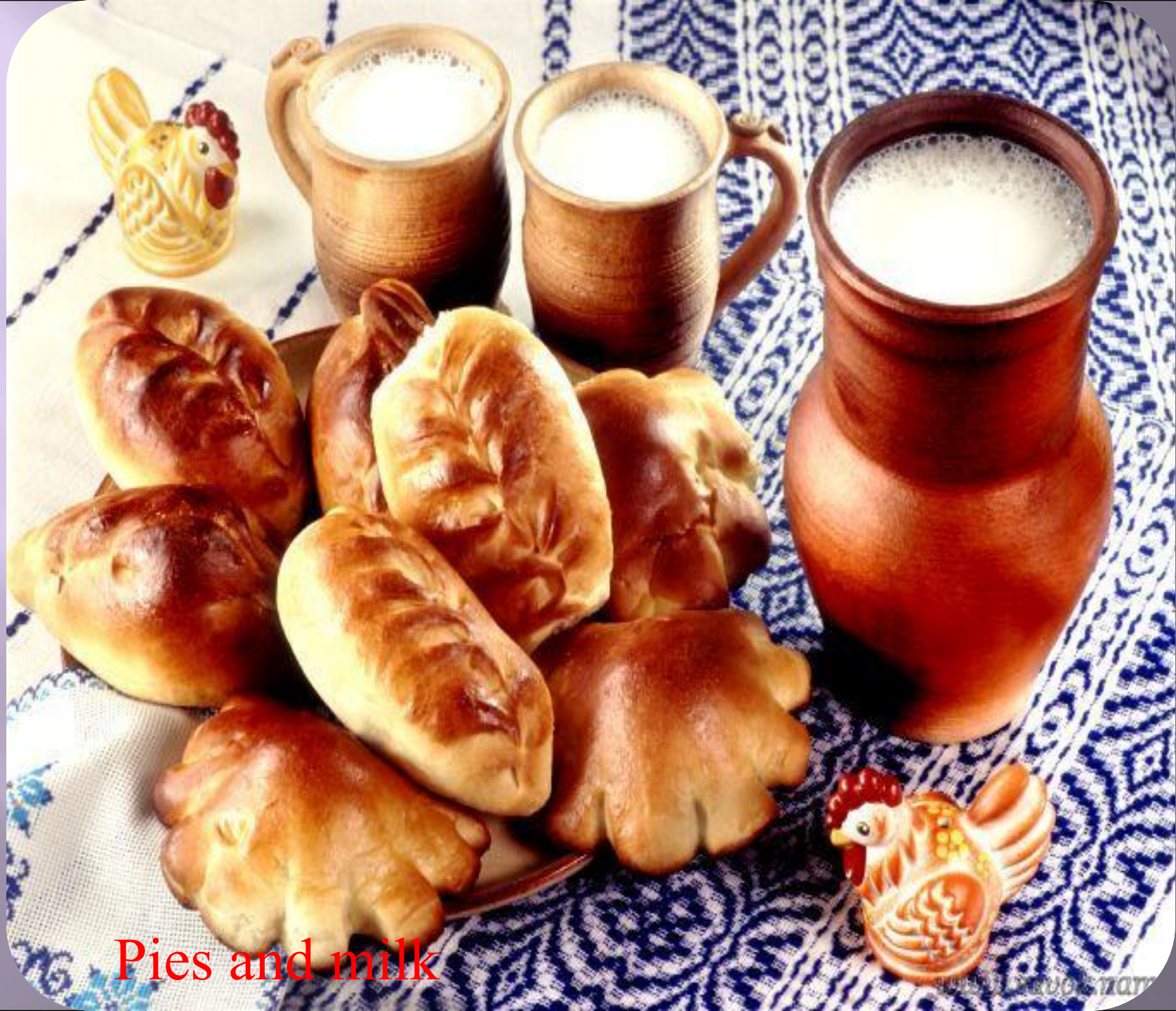
Pies and milk