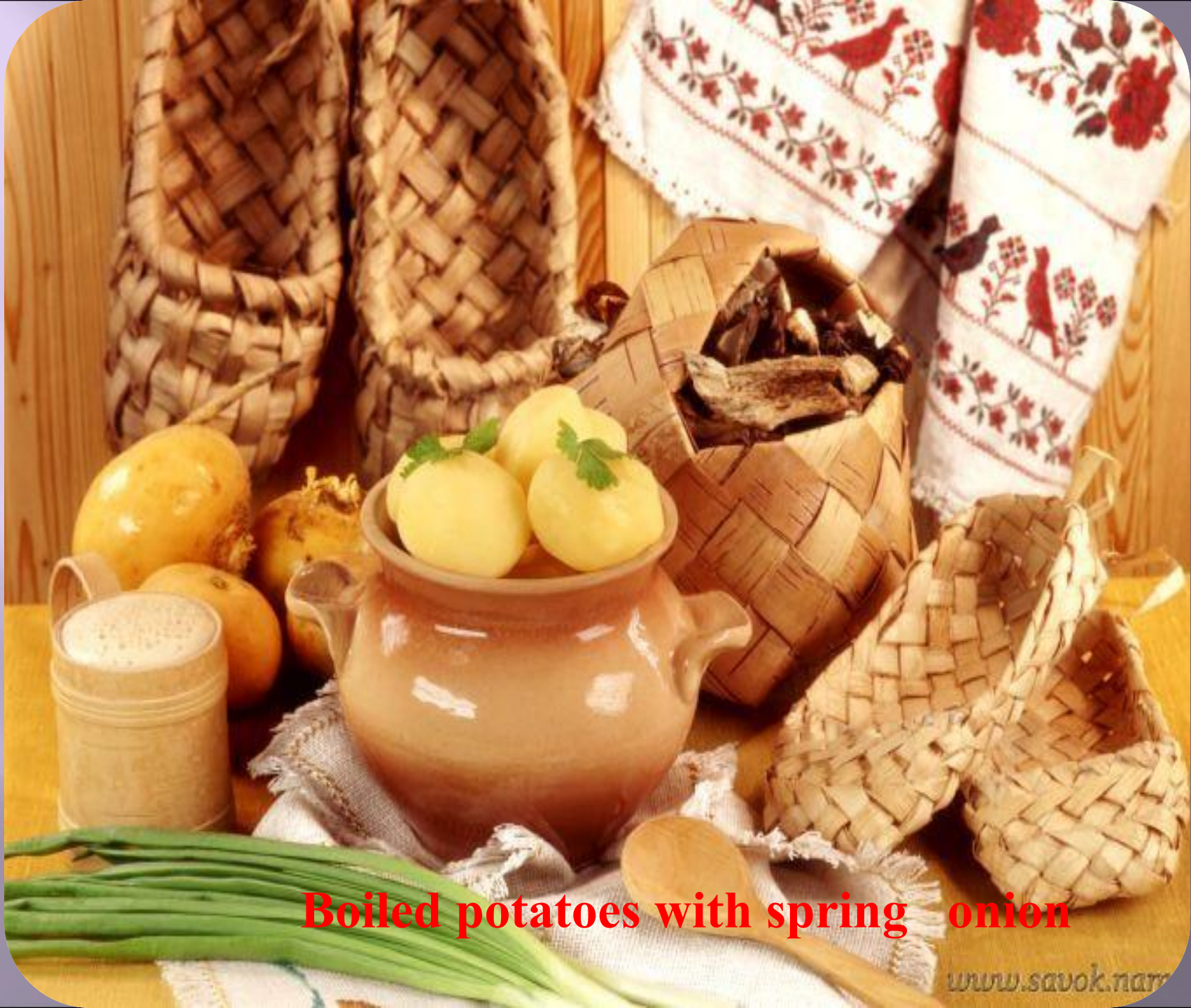
Boiled potatoes with spring onion