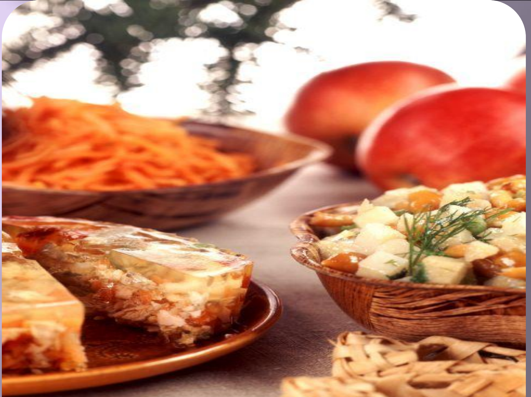
Holodez (meat in jelly)