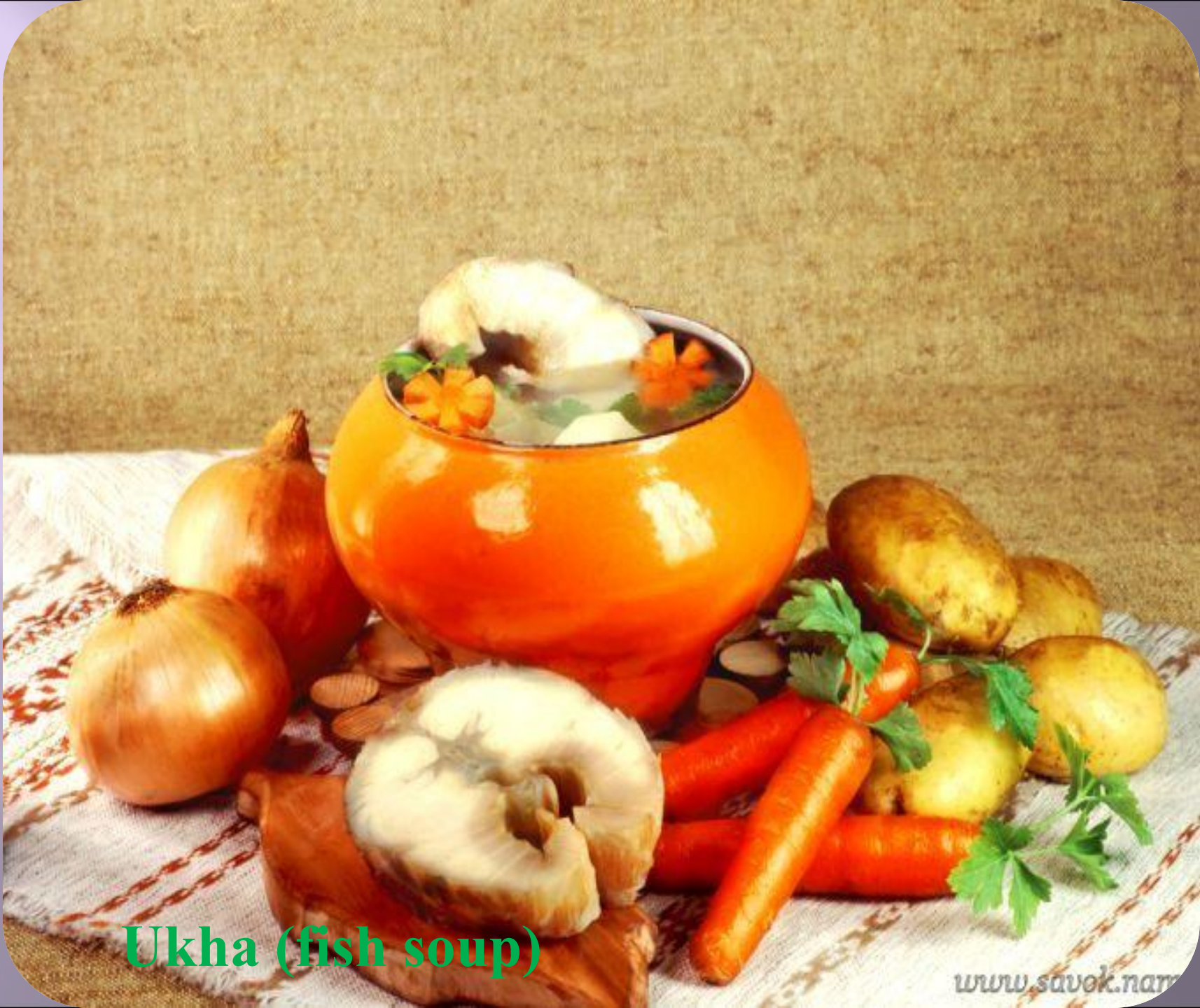
Ukha (fish soup)