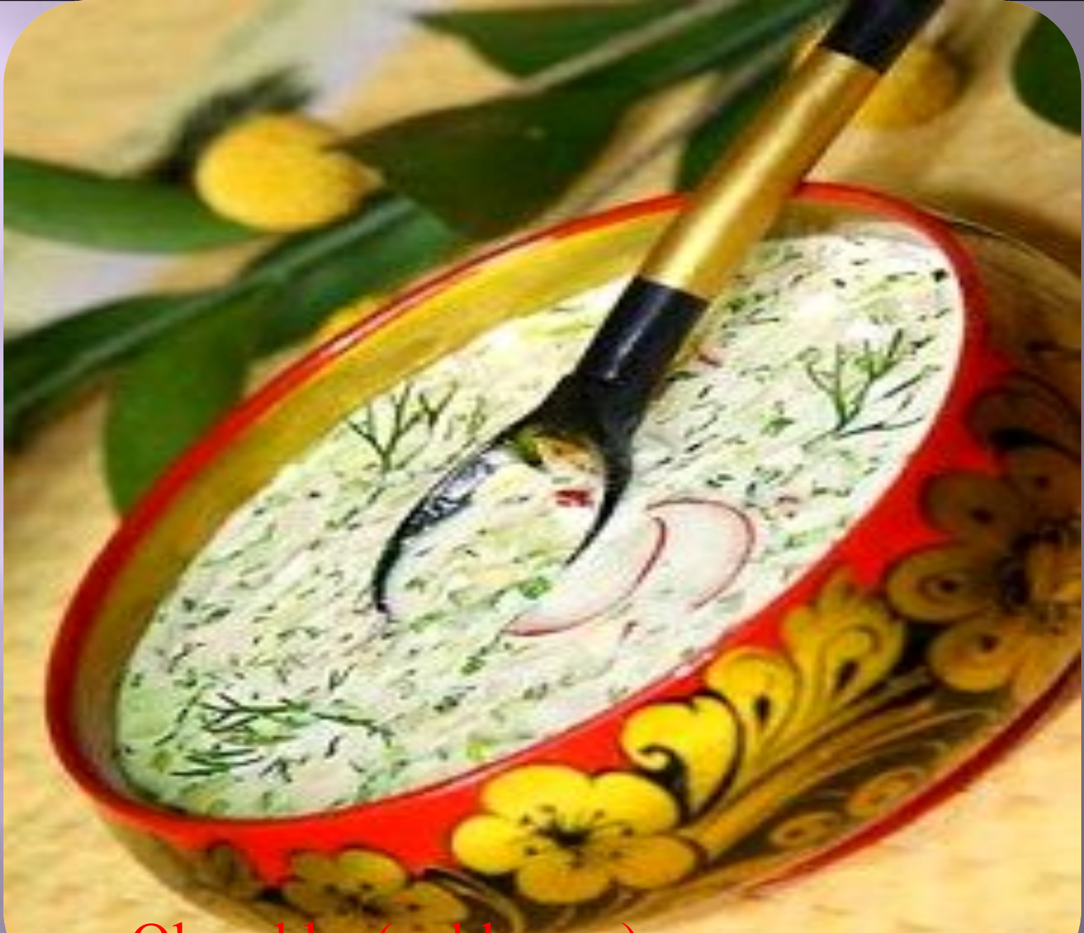
Okroshka (cold soup)