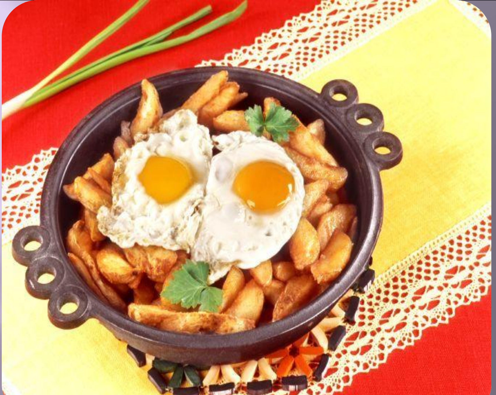
Fried potatoes with fried eggs