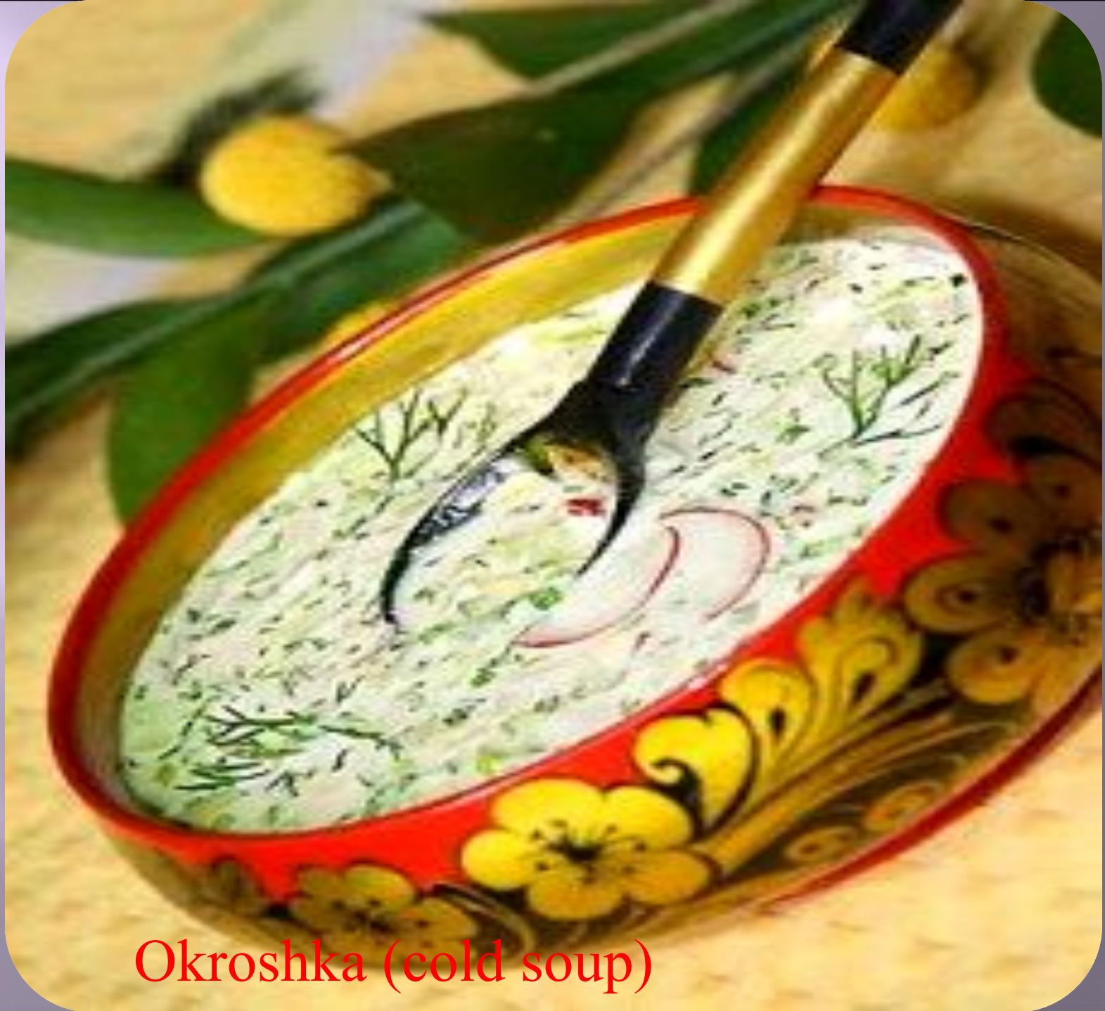
Okroshka (cold soup)