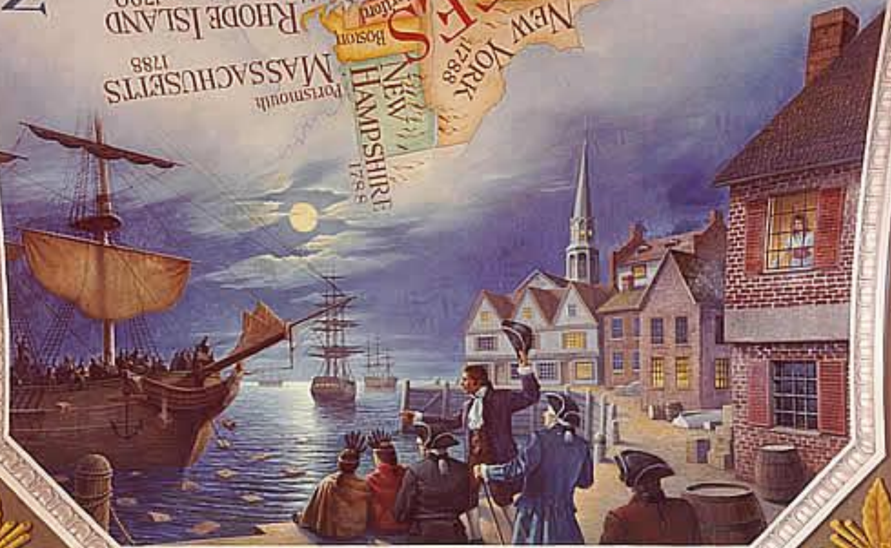
BOSTON TEA PARTY. 1773

WEST TERRITORY CONNECTICUT RESERVE PENNSYLVANIA 1787 NEW YORK 1788 NEW HAMPSHIRE 1798 MASSACHUSETTS 1788 RHODE ISLAND 1790 CONNECTICUT 1788 NEW JERSEY 1787 NEW YORK HARTFORD BOSTON PROVIDENCE TRENTON PHILADELPHIA