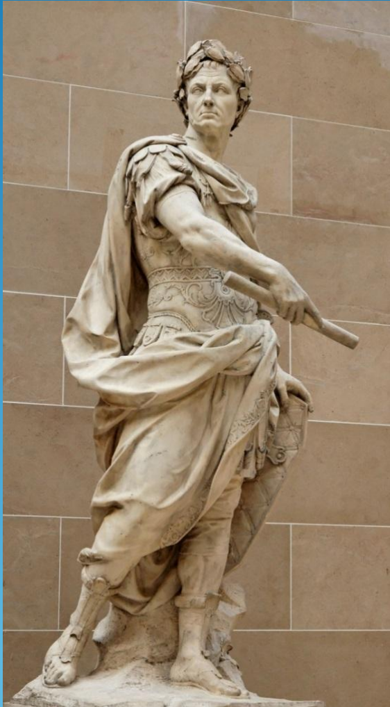
Julius Caesar The Roman Emperor