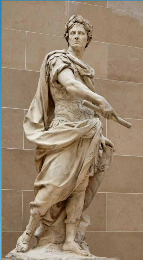
Julius Caesar The Roman Emperor