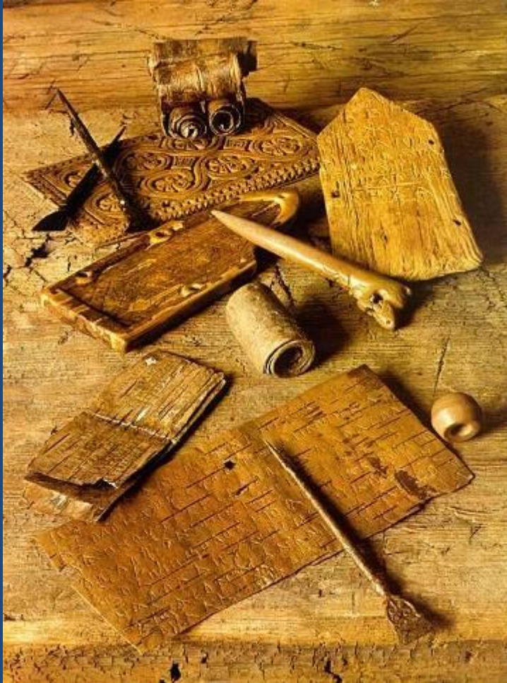
Tablets of wood