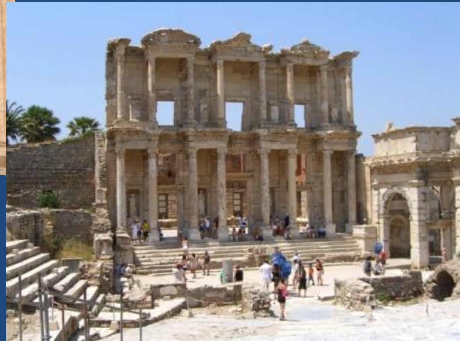
Library in Greece