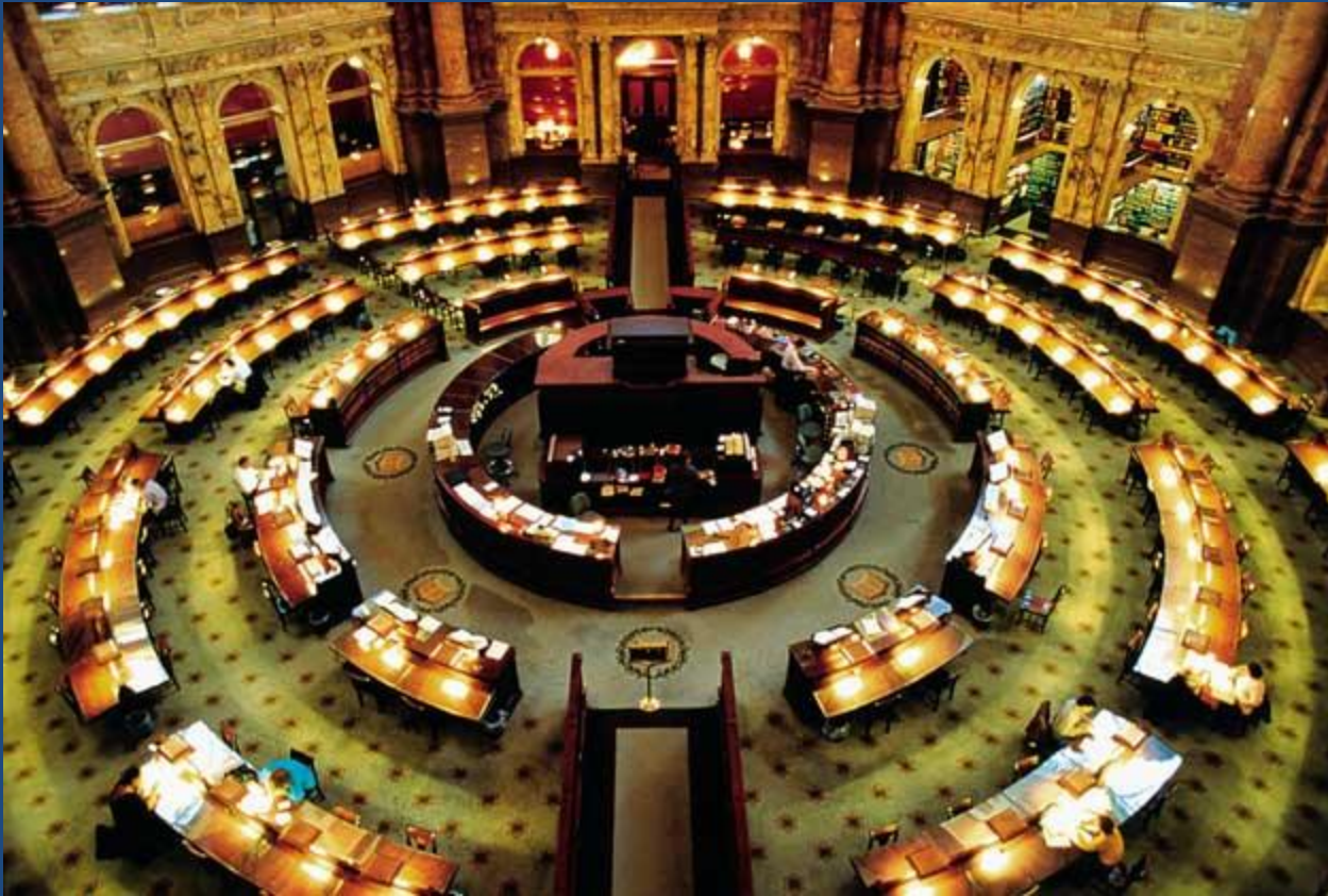
The Library of the Congress in the United States