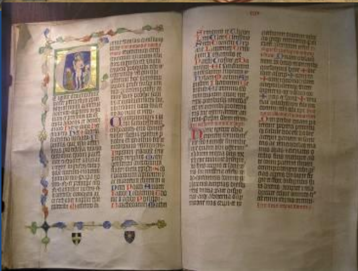
Cookbook of Richard II