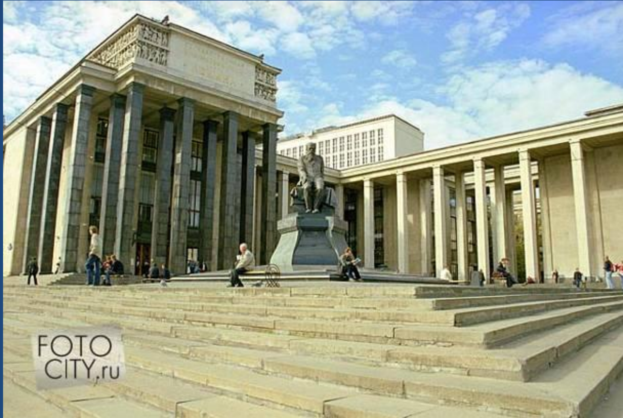
The State Public Library in Moscow