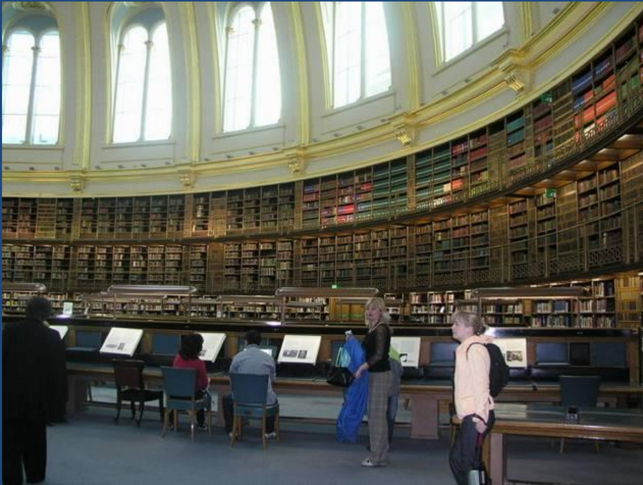
The British Museum Library