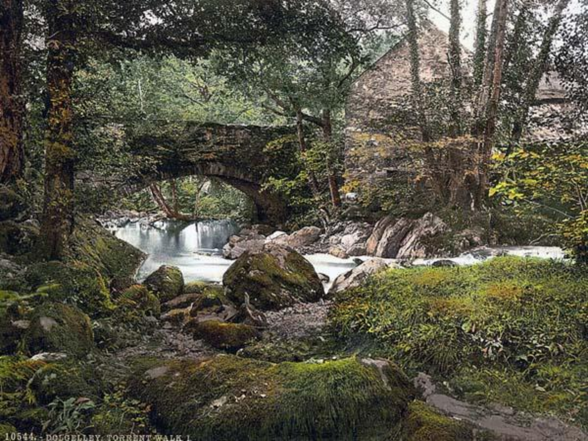
10544. - DOLGELLEY, TORRENT WALK I.