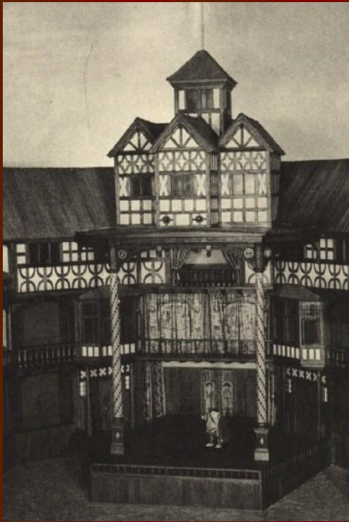
Entrance of The Globe Theater