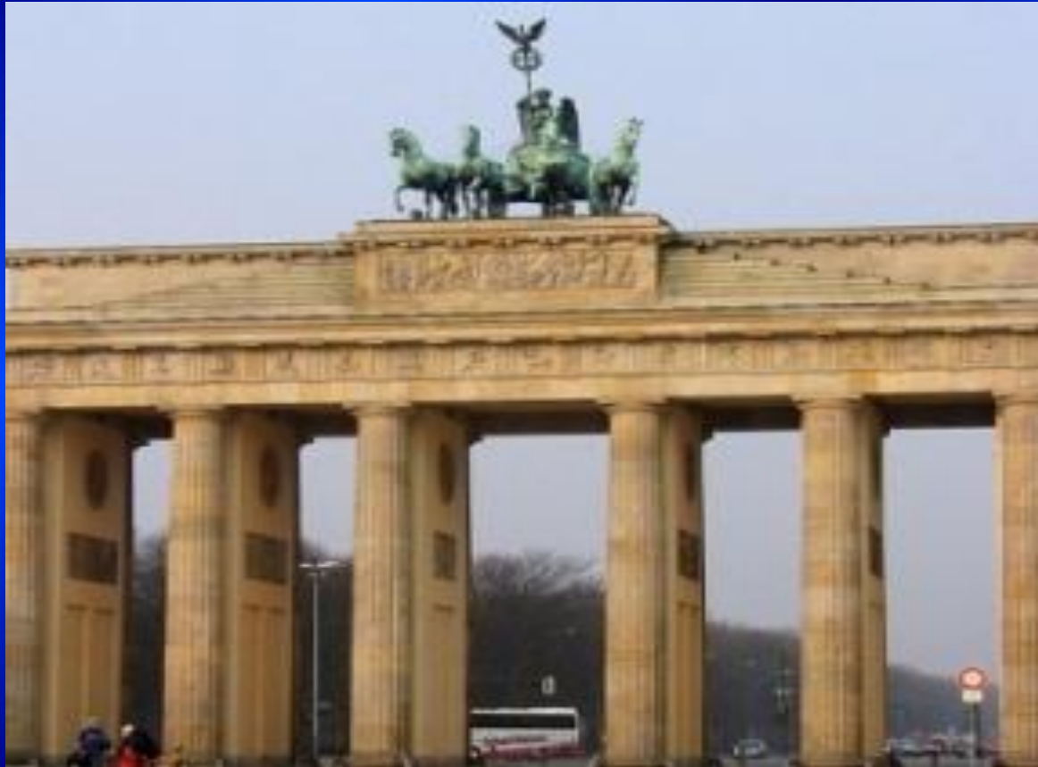
The Brandenburg gate