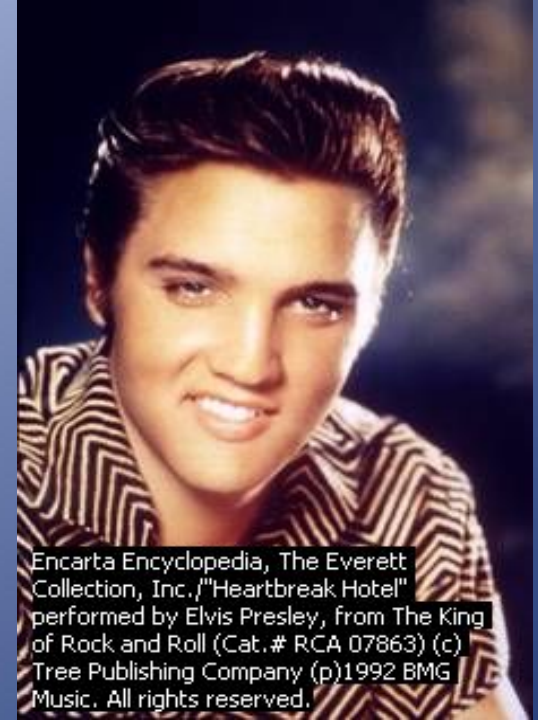
"Heartbreak Hotel" performed by Elvis Presley, from The King of Rock and Roll (Cat. # RCA 07863) (c) Tree Publishing Company (p)1992 BMG Music. All rights reserved.