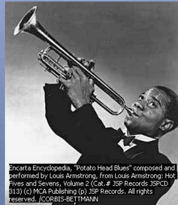
Encarta Encyclopedia, "Potato Head Blues" composed and performed by Louis Armstrong, from Louis Armstrong: Hot Fives and Sevens, Volume 2 (Cat.# JSP Records JSPCD 813) (c) MCA Publishing (p) JSP Records. All rights reserved.