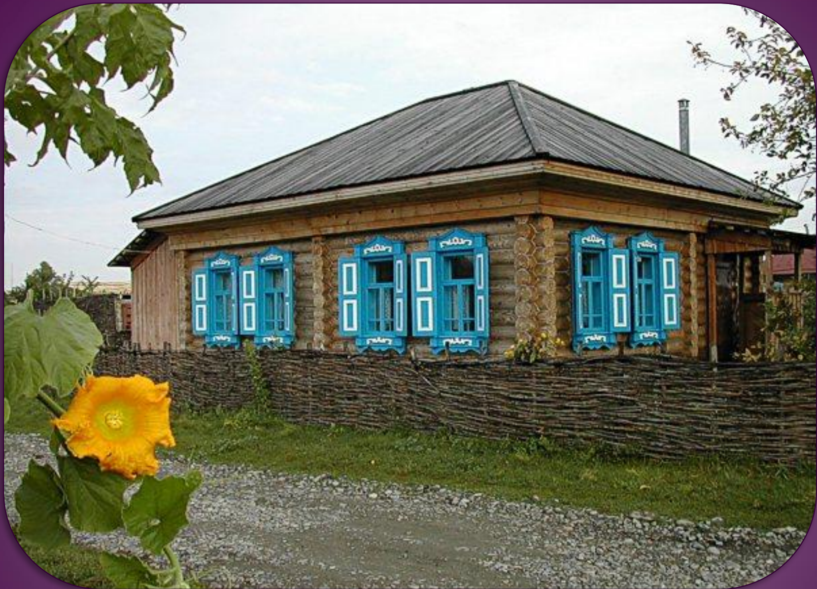
The house, where V.M. Shukshin spent his childhood and youth.