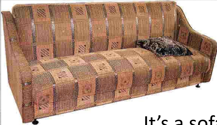
It's a sofa

8. A thing where we can sit or sleep. It is usually in the sitting room