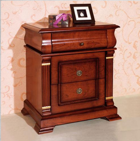
It's a clothes-press

8. A thing where we can sit or sleep. It is usually in the sitting room