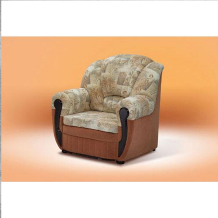
It's a table