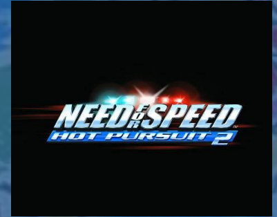
Playing computer games