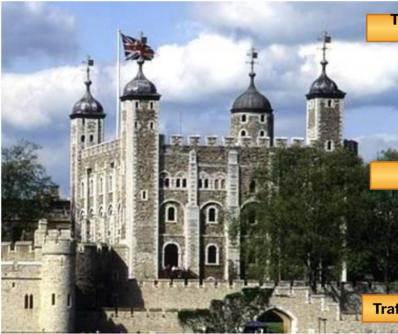
The Tower of London