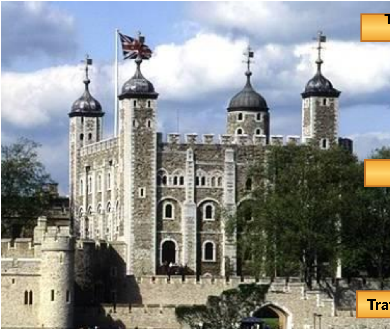
The Tower of London