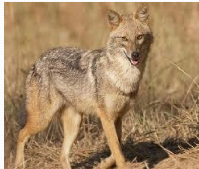
Turkmen golden jackals