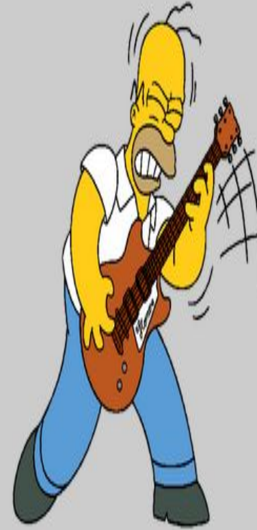
Homer 39 years old 80 kilos 1.55 mt