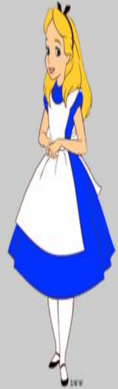
Alice 9 years old 33 kilos 1.20 mt