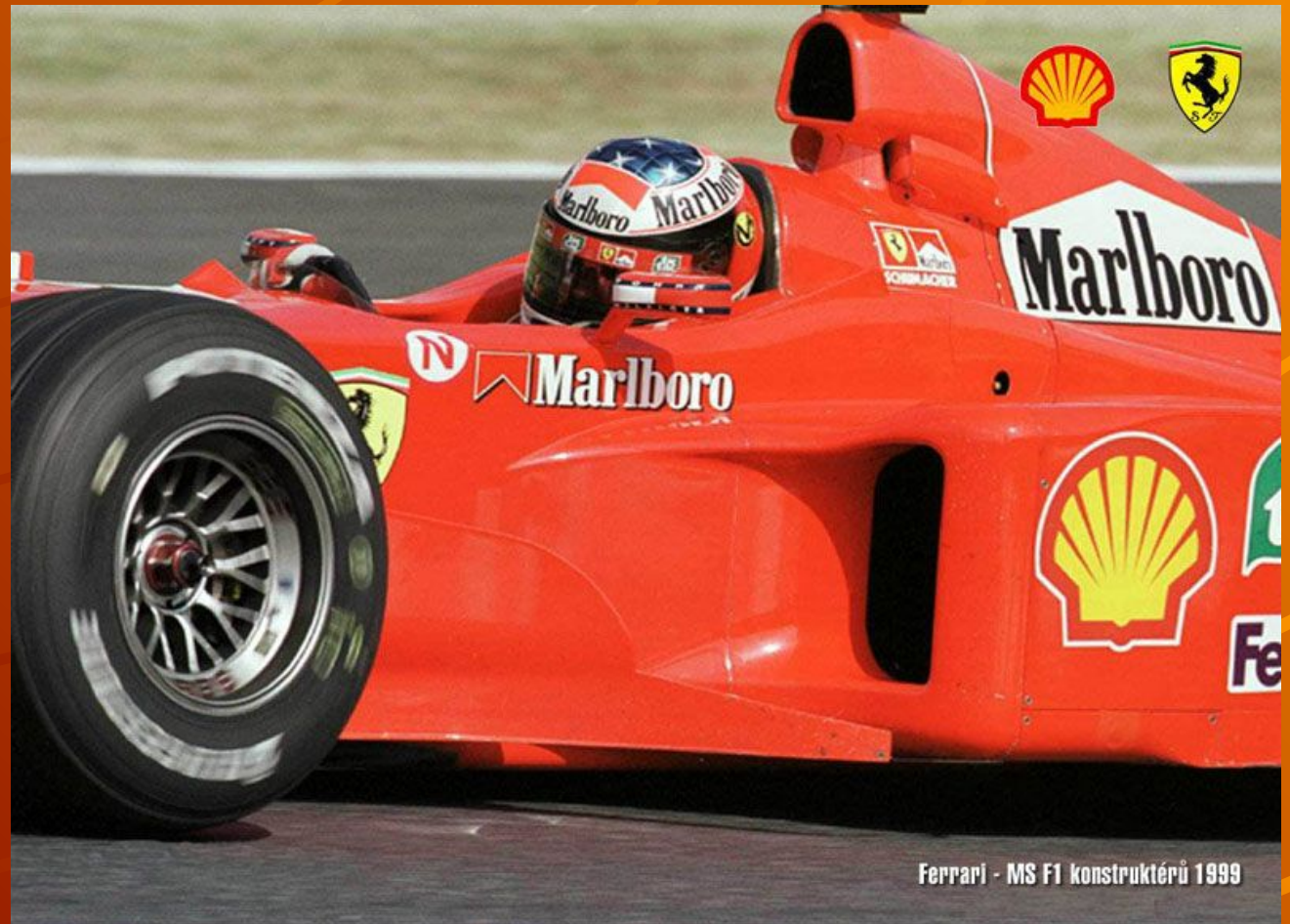
Ferrari - MS F1 konstruktérü 1999