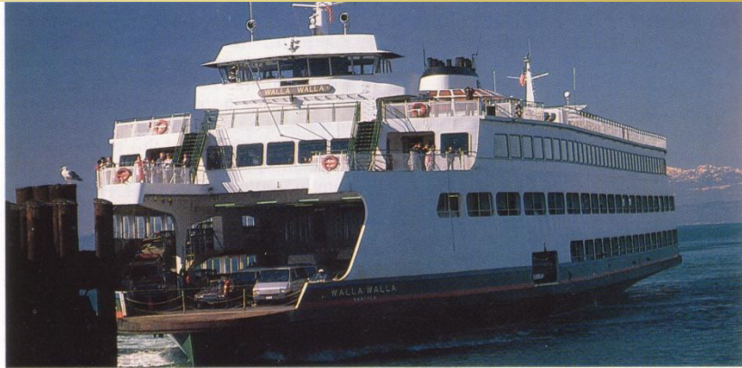
Some people commute by car and ferry on Puget Sound.