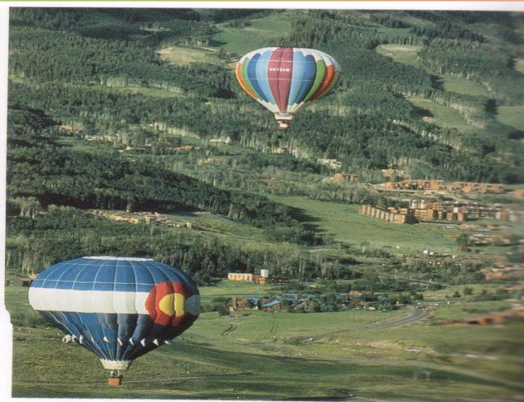
Hot-air balloons over the mountains

Хотите провести день весело и интересно?