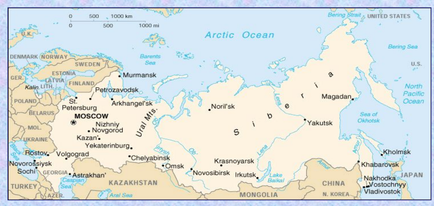
It is the biggest country in the world. It is situated on two continents: Europe and Asia.