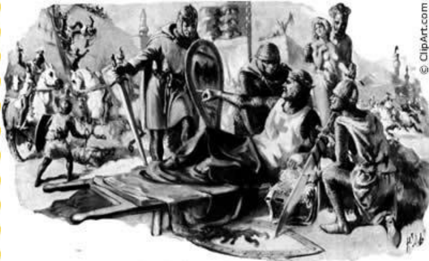
Richard the Lionheart dying

He spent the remaining five years of his life fighting against Philip and building his castle, the Château Gaillard, in Normandy. While laying siege to a castle in southern France, he was hit by a crossbow bolt and died a few days later. His brother John succeeded him.