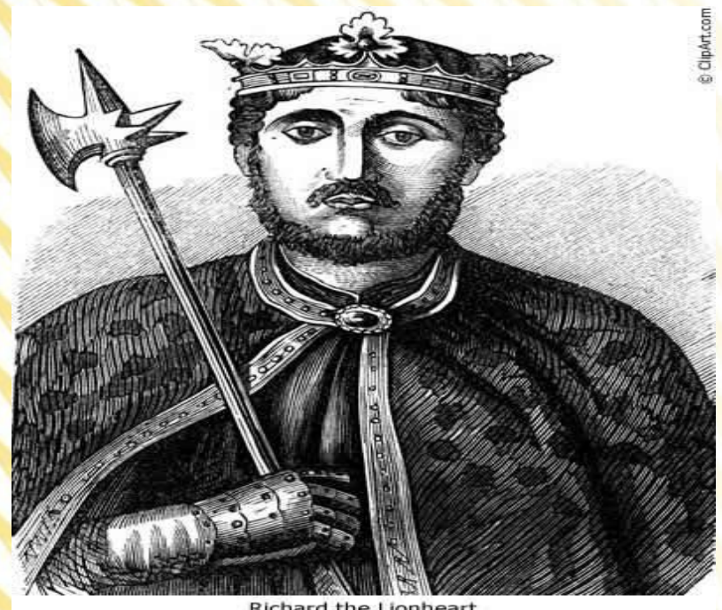
Richard the Lionheart