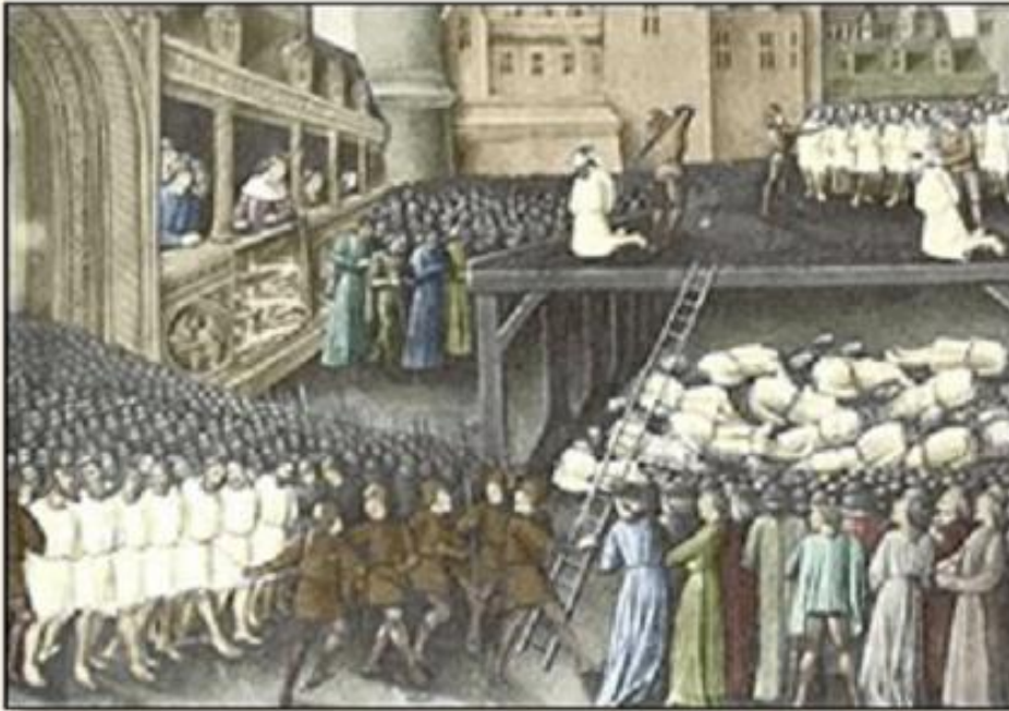
Richard watches the massacre From a 15th century illustration

Meanwhile in England Richard's brother John had been plotting with Philip to divide Richard's realm. John wanted the emperor to keep Richard prisoner, but Hubert Walter raised the money for his ransom and Richard was set free early in 1194. Richard hurried to England but stayed only long enough to raise more money for a new campaign in France.