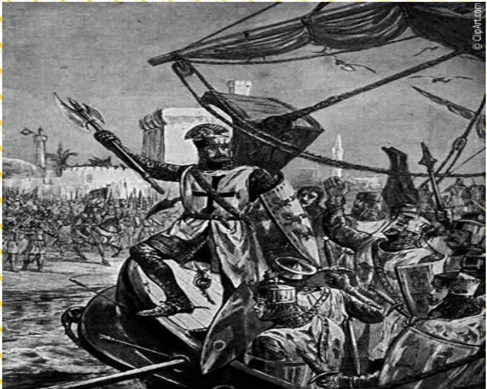
Richard the Lionheart Makes a Sea Landing