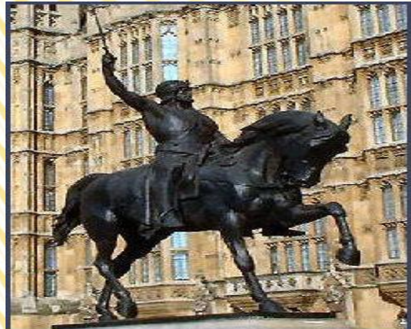
Statue of Richard the Lionheart outside the Houses of Parliament