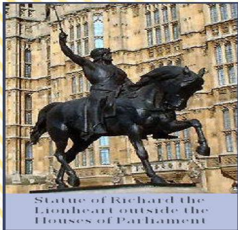
Statue of Richard the Lionheart outside the Houses of Parliament