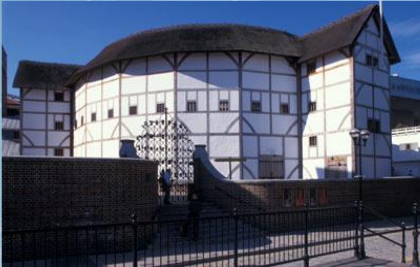
New Globe theatre.