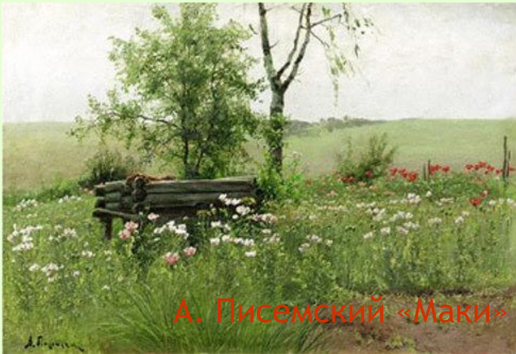
А. Писемский «Маки»