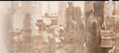
עורך הלבנון: יחיאל ברייל

עיתונות עברית היסטורית בית הספרים הלאומי והאוניברסיטאי מפעל הדיגיטציה ע"ש משה דוד וסלח שאול