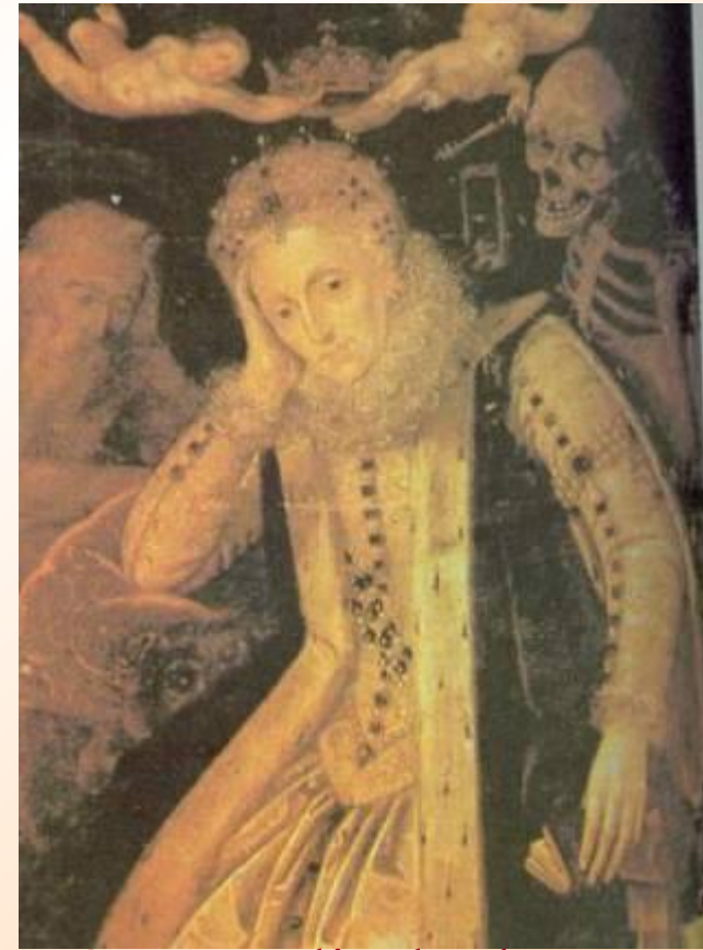
«Queen Elizabeth. Time and death». 1600

«All the mechanism of my rule is in breaking » – from the letter of Elizabeth I to Henry IV, the King of France.