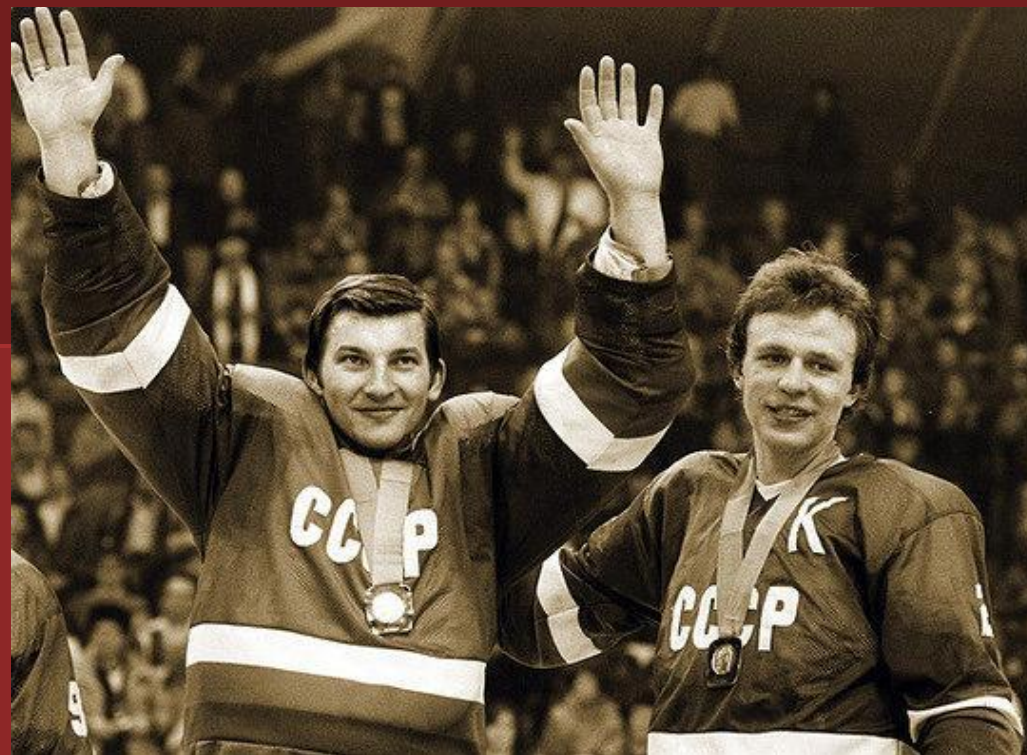
Vladislav Tretyak and Vyacheslav Fetisov