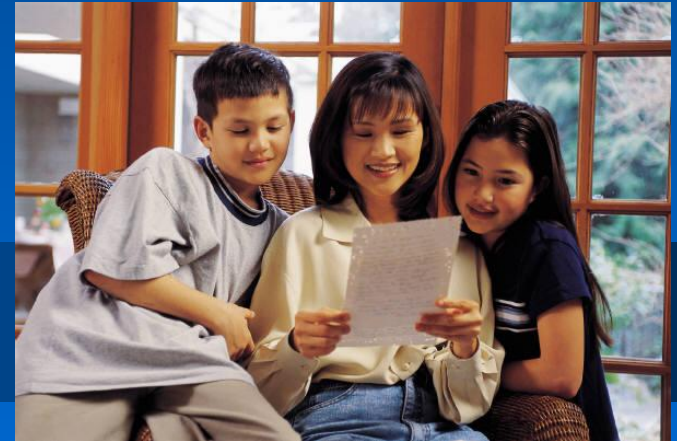
Relationship with the mates