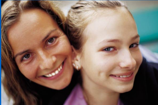
Relationship with the parents