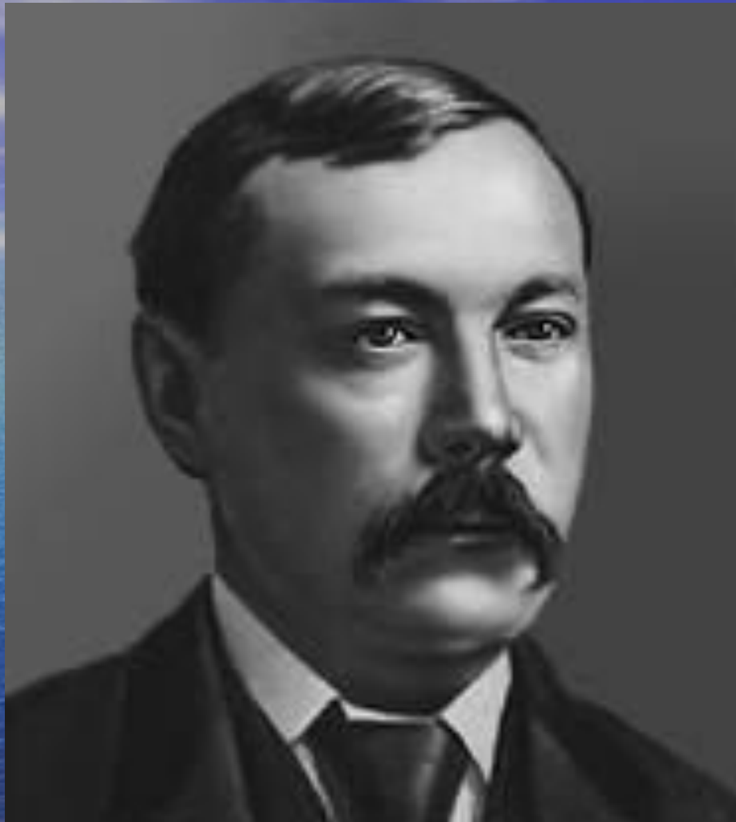
A. Conan Doyle (1859—1930)