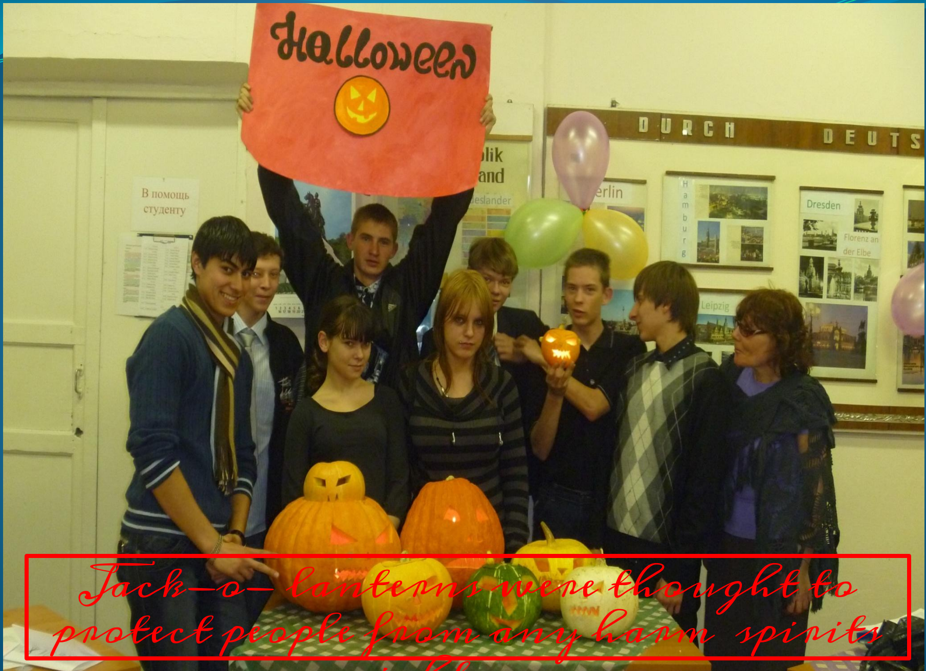
Jack-o-lanterns were thought to protect people from any harm spirits might cause.