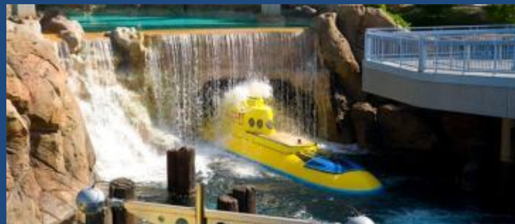
Attraction of cup