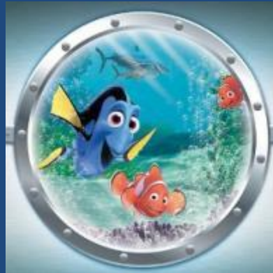
Finding Nemo Submarine Voyage