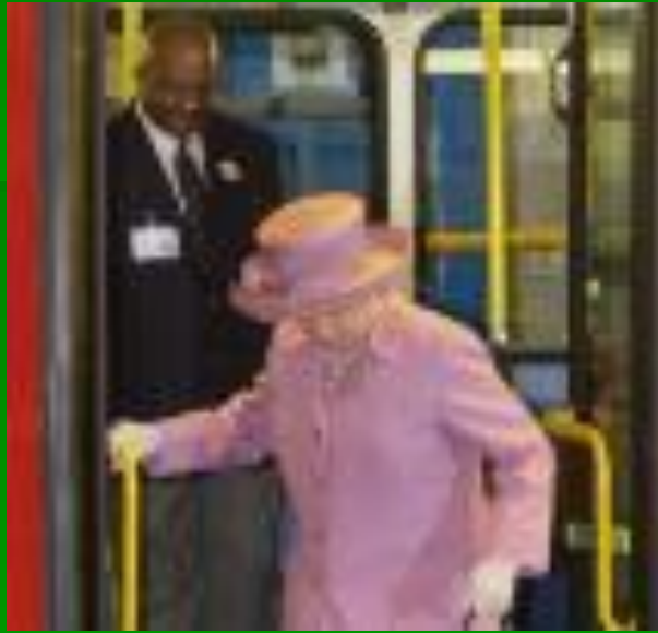
The Queen on a double-decker bus