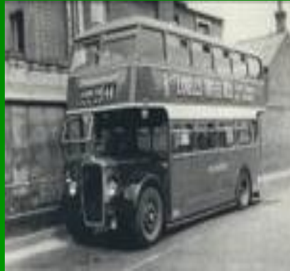
Double-decker bus in 1896