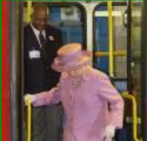
The Queen on a double-decker bus