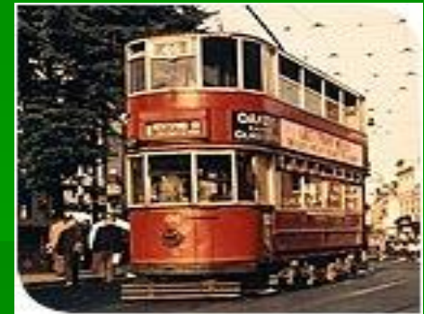
Double-decker bus in 1896