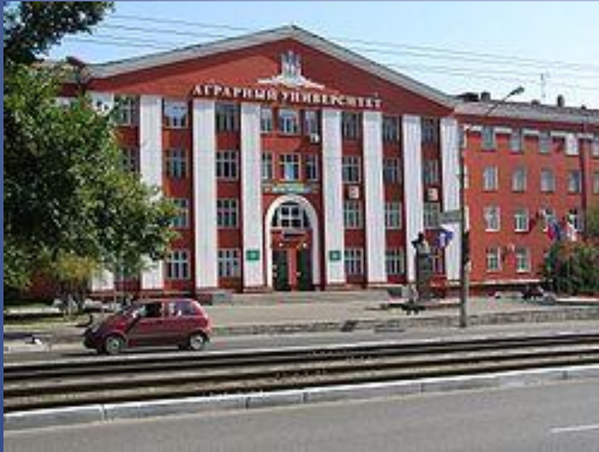
The Altai State Agrarian University