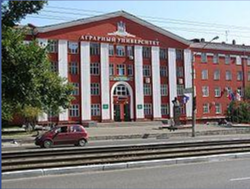
The Altai State Agrarian University