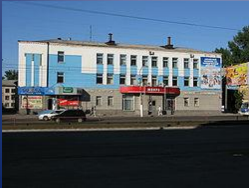
Altai Economics and Law Institute