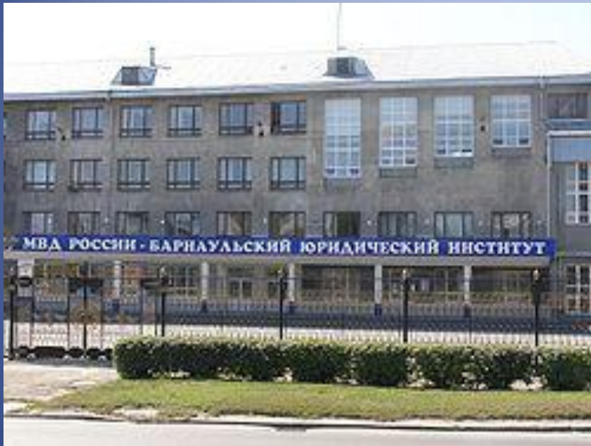
Barnaul Institute of Law, Ministry of Internal Affairs of Russia