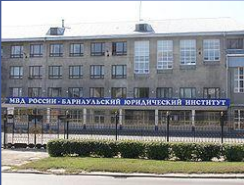
Barnaul Institute of Law, Ministry of Internal Affairs of Russia