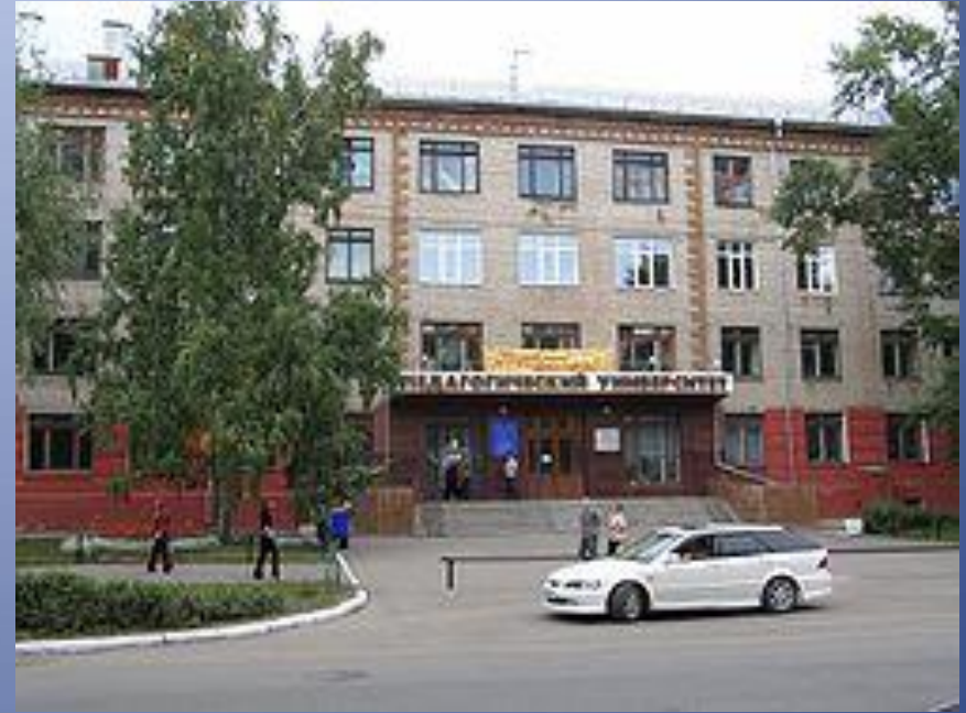
Altai State Pedagogical Academy