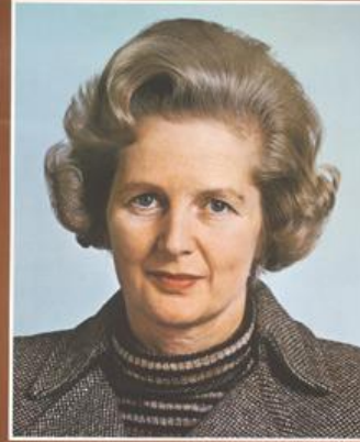
The Rt. Hon. Margaret Thatcher MP Leader of the Conservative Party