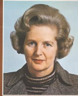
The Rt. Hon. Margaret Thatcher MP Leader of the Conservative Party