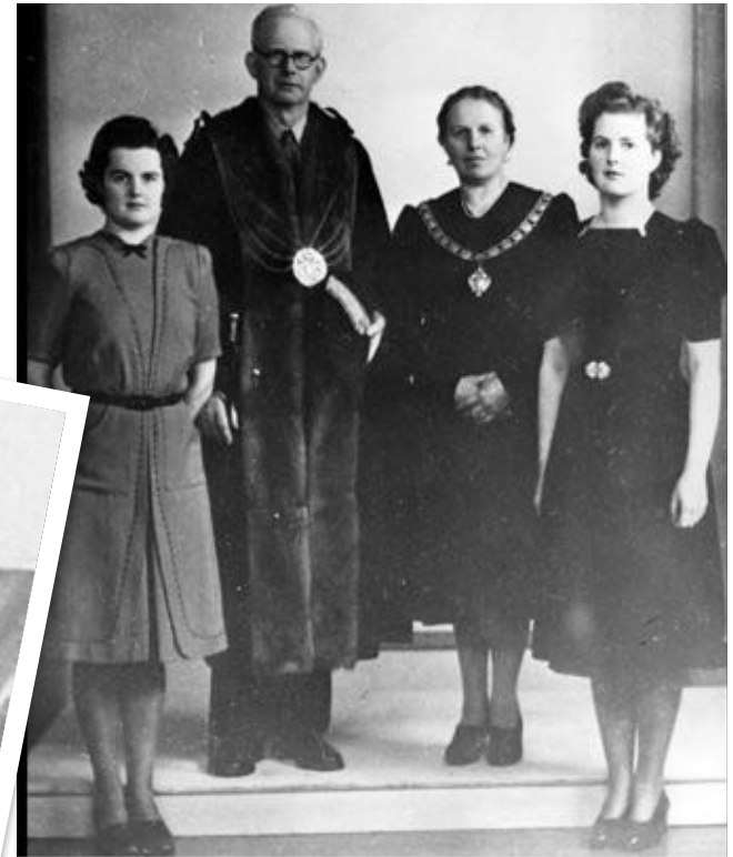
A young Margaret Roberts (right) stands for a portrait with her parents and sister, Muriel. (1945)