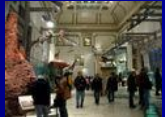
The Hall of Mammals