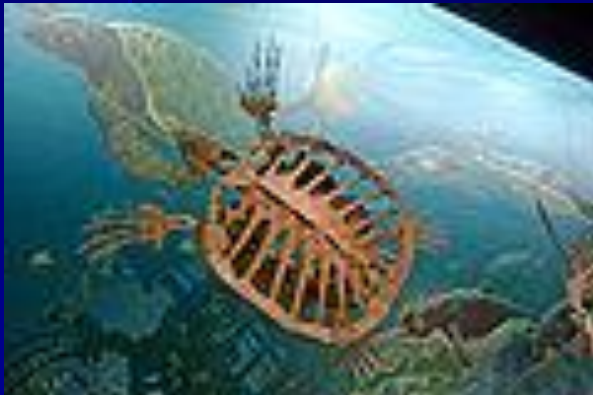
The skeleton of a prehistoric sea turtle