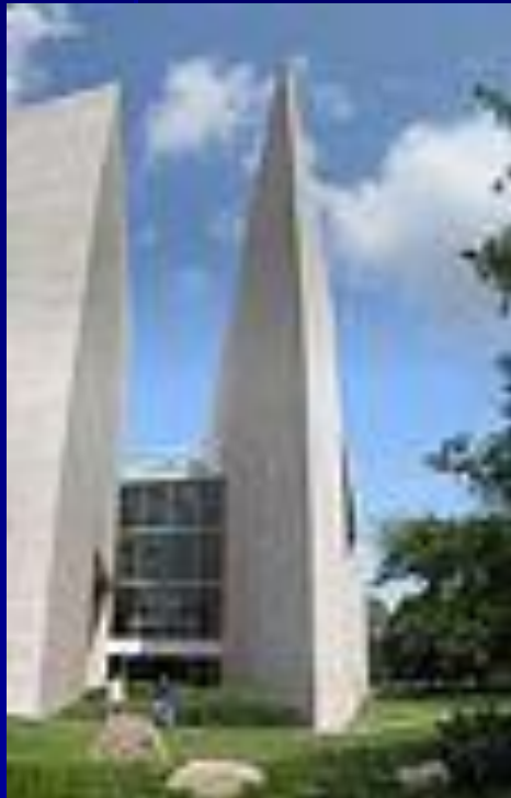
Detail of the corner of the East Building