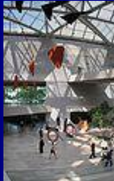
the Interior view of the East Building