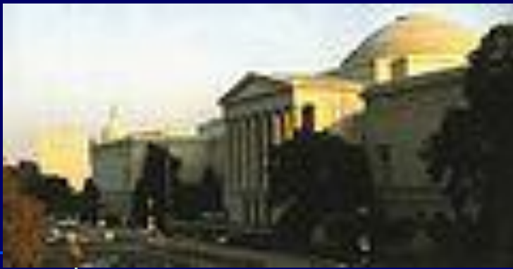
the West building of the National Gallery of Art, with the East Building and the US Capitol