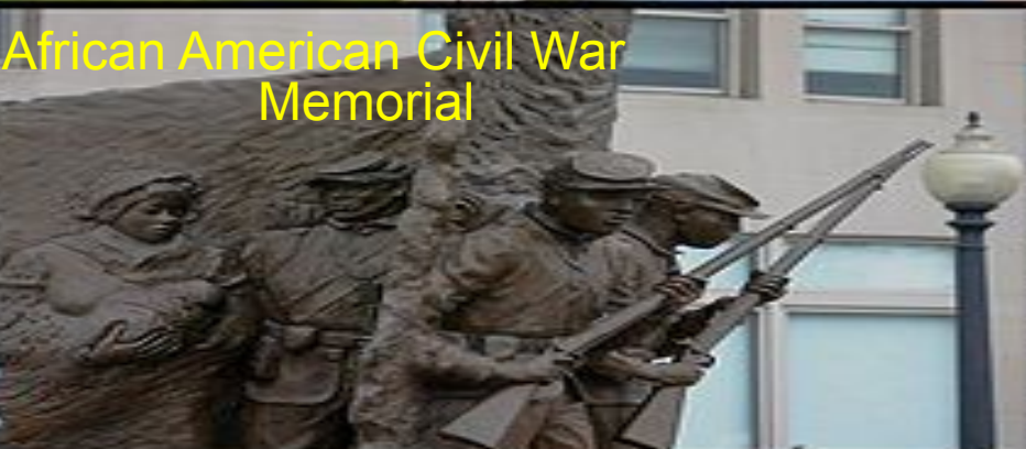
African American Civil War Memorial