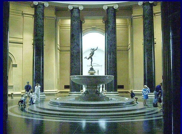
Centerpiece on the main floor of the West Building