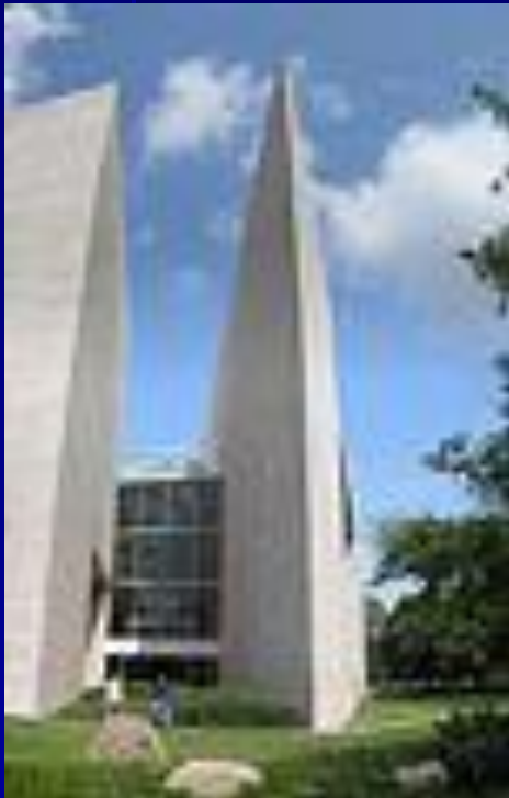
Detail of the corner of the East Building