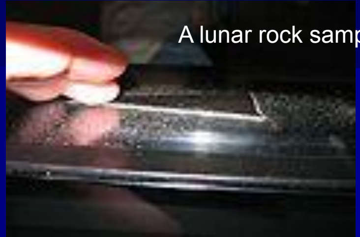
A lunar rock sample