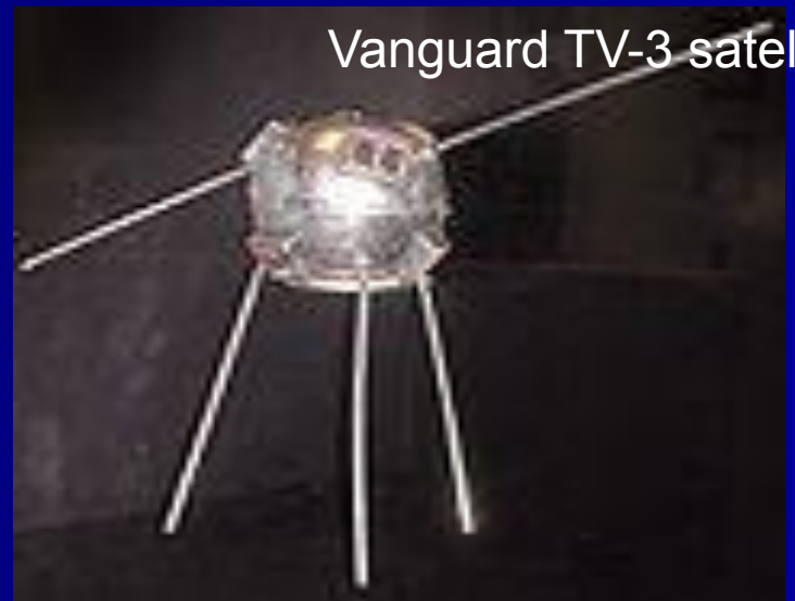
Vanguard TV-3 satellite