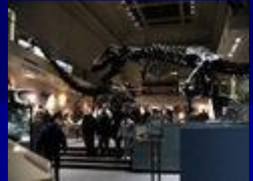
The Hall of Dinosaurs