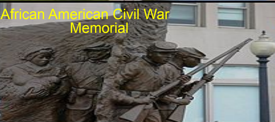
African American Civil War Memorial