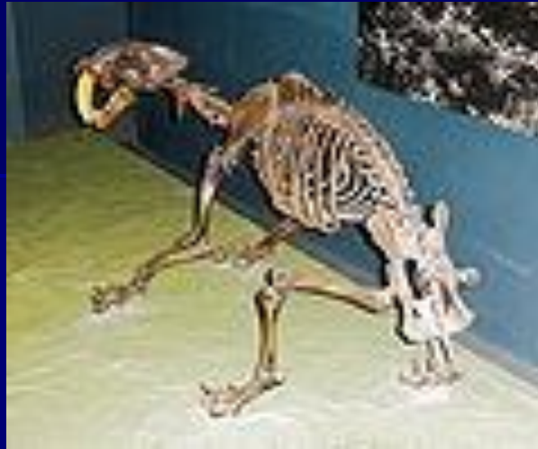
The Hall of Dinosaurs