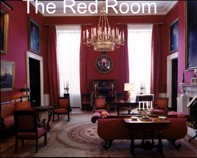
The Red Room