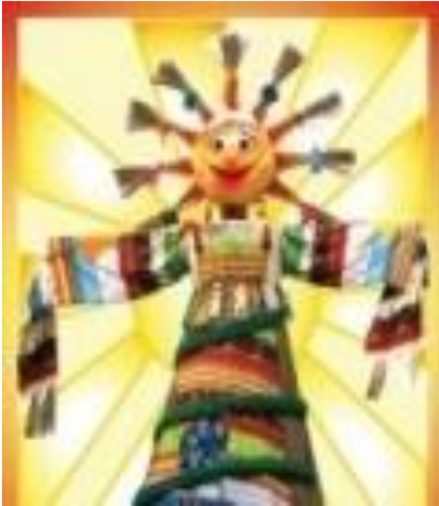
A Maslenitsa doll.