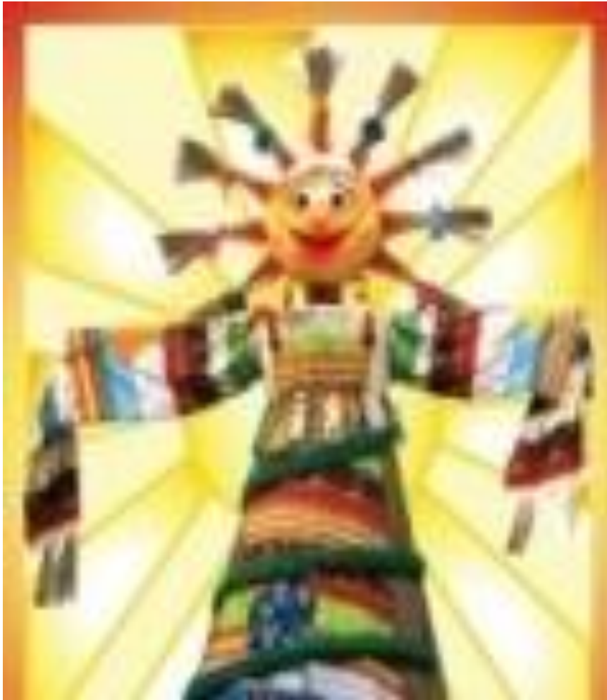
A Maslenitsa doll.