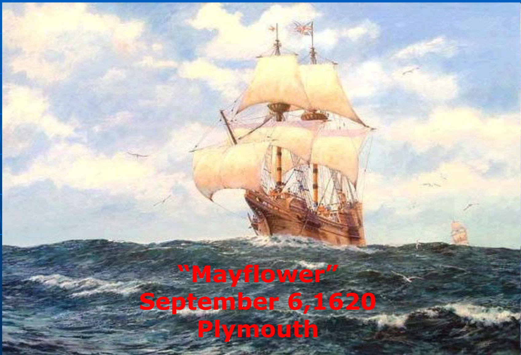
"Mayflower" September 6, 1620 Plymouth