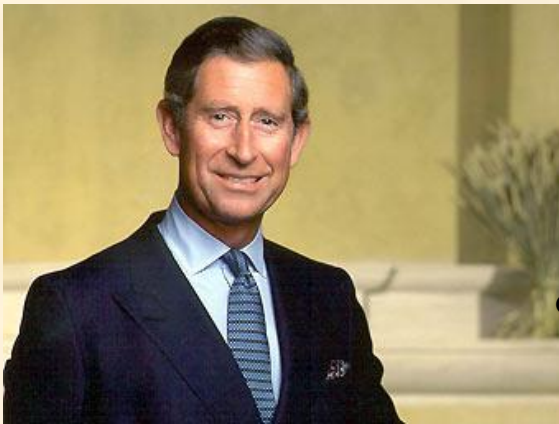
● The throne prince Charles