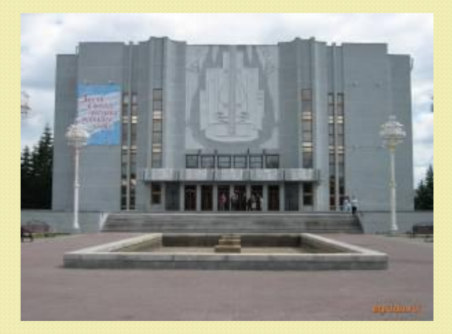
The Philharmonic Hall