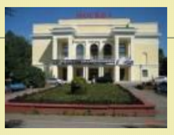
The Cinema "Moskva"