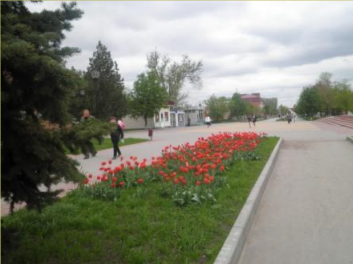
The central alley