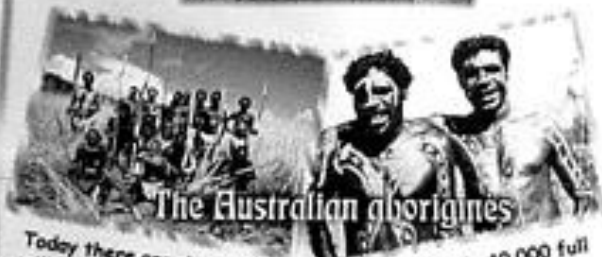
The Australian aborigines

Today there are about fifteen million people in Australia; most of them are of British origin.