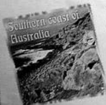
Southern coast of Australia