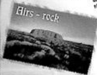
Airs - rock

New Year is in the middle of summer, the middle of winter is in June, and the winter months are very cold. Hot winds blow from the north, cold winds blow from the south.