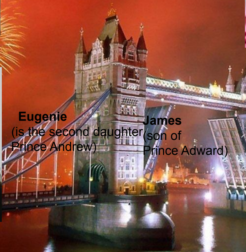
James (son of Prince Edward)