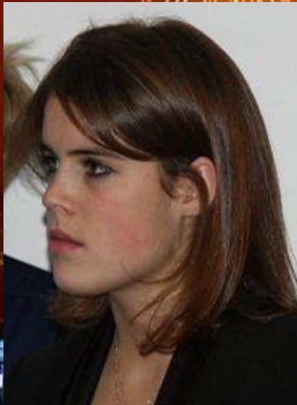
Eugenie (is the second daughter of Prince Andrew)