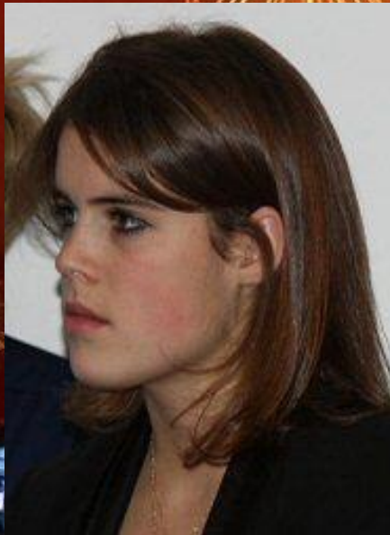
Eugenie (is the second daughter of Prince Andrew)