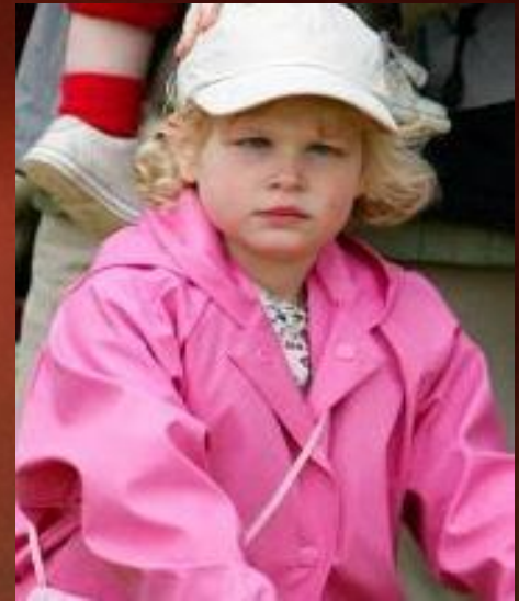
Louise (daughter of Prince Edward)