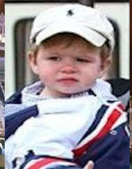
James (son of Prince Edward)