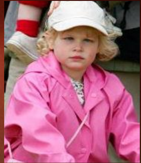
Louise (daughter of Prince Edward)