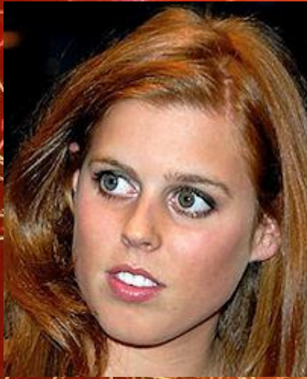
Beatrice (is the eldest daughter of Prince Andrew)