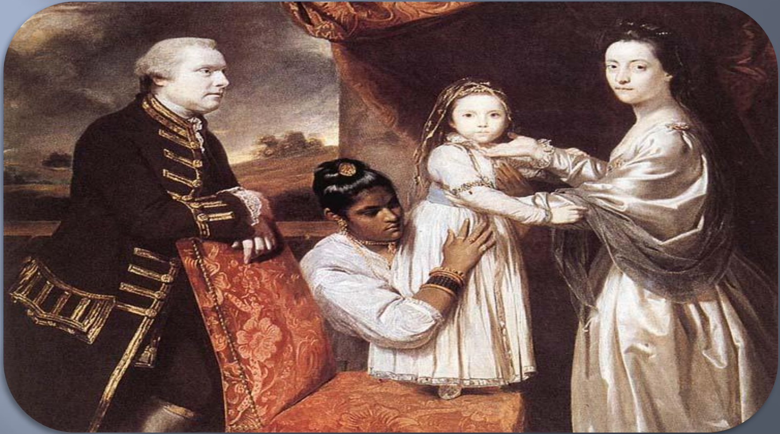
«Robert Clive and his family with an Indian maid», painted 1765.