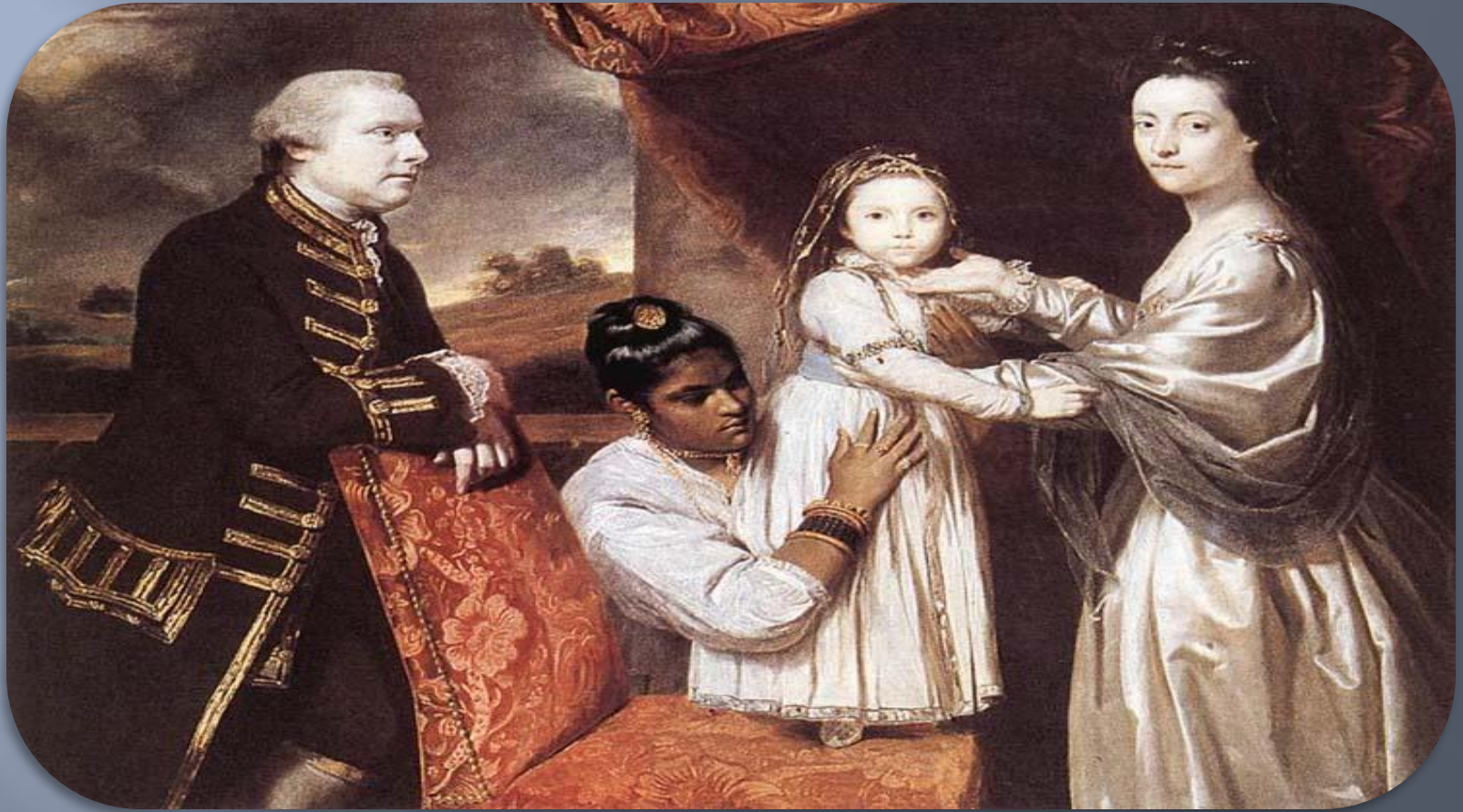
«Robert Clive and his family with an Indian maid», painted 1765.