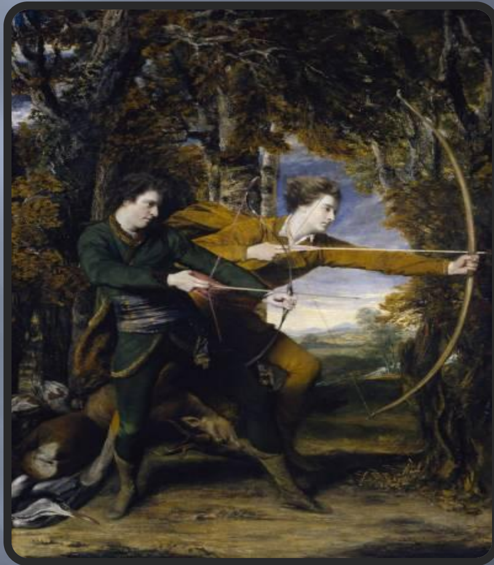
Colonel Acland and Lord Sydney, The Archers, 1769. In September 2005, the Tate Gallery acquired the painting for over US$4.4 million